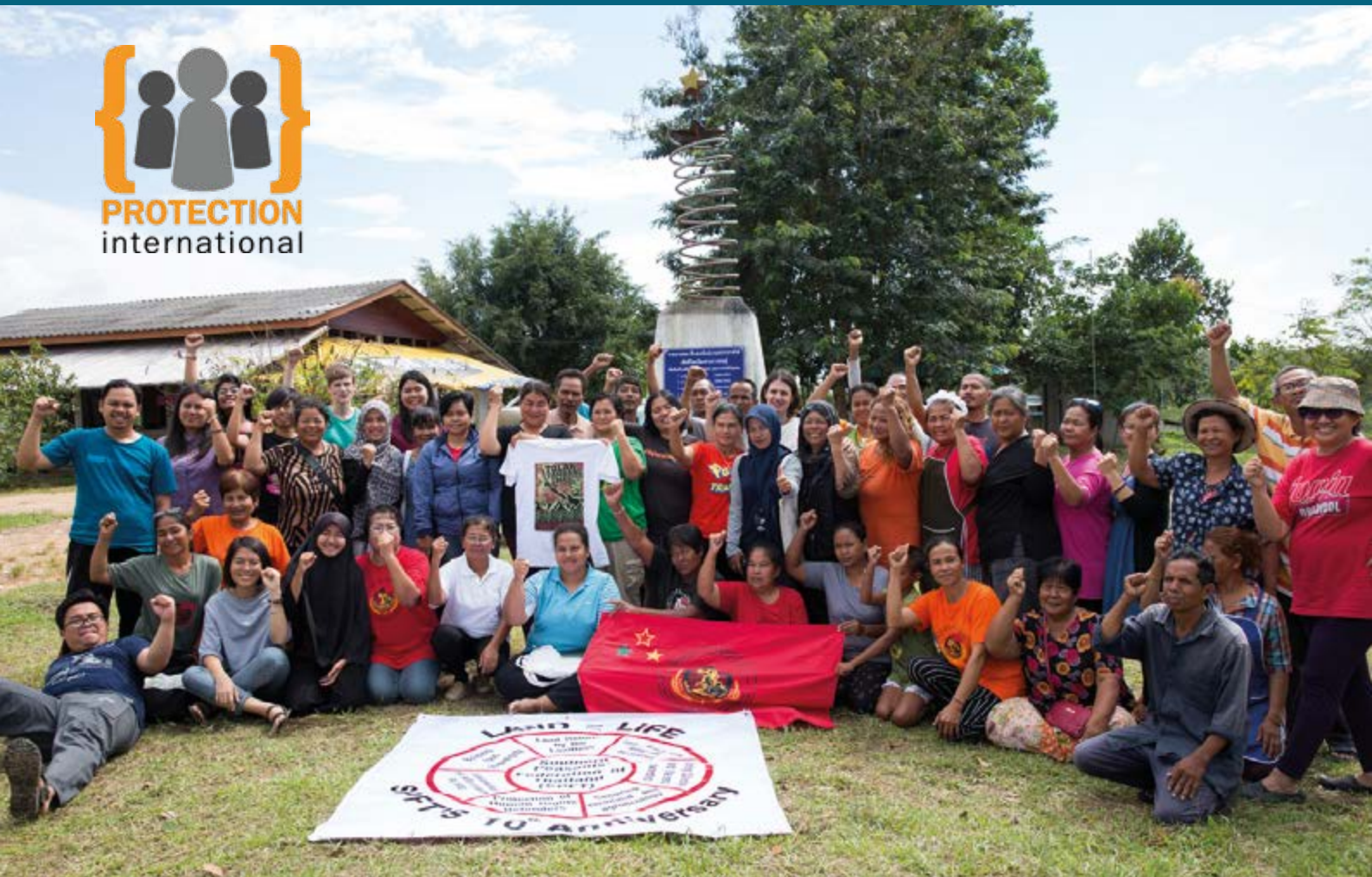
A Thai-Indo human rights defenders community exchange Protection International organised in December 2018, in Southern Thailand, with the Southern Peasants Federation of Thailand (SPFT) and six Indonesian buruh tani (peasant farm workers) organisations.