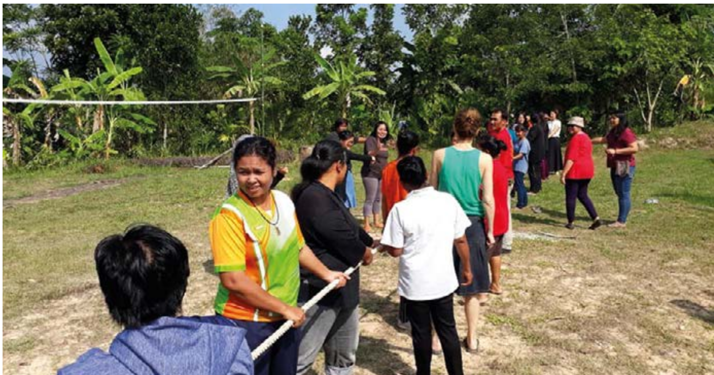
Indonesian and Thai human rights defenders participate at a workshop on protection strategies during the community exchange organised by Protection International in December 2018, in Southern Thailand.

of judicial bodies to prosecute cases brought by NHRIs traps their work in a capacity that is strictly investigatory and ultimately advisory. However, this factor reinforces the importance of mandate interpretation and the complementary role of civil society mobilisation. As Commissioner Siti Noor Laila noted: