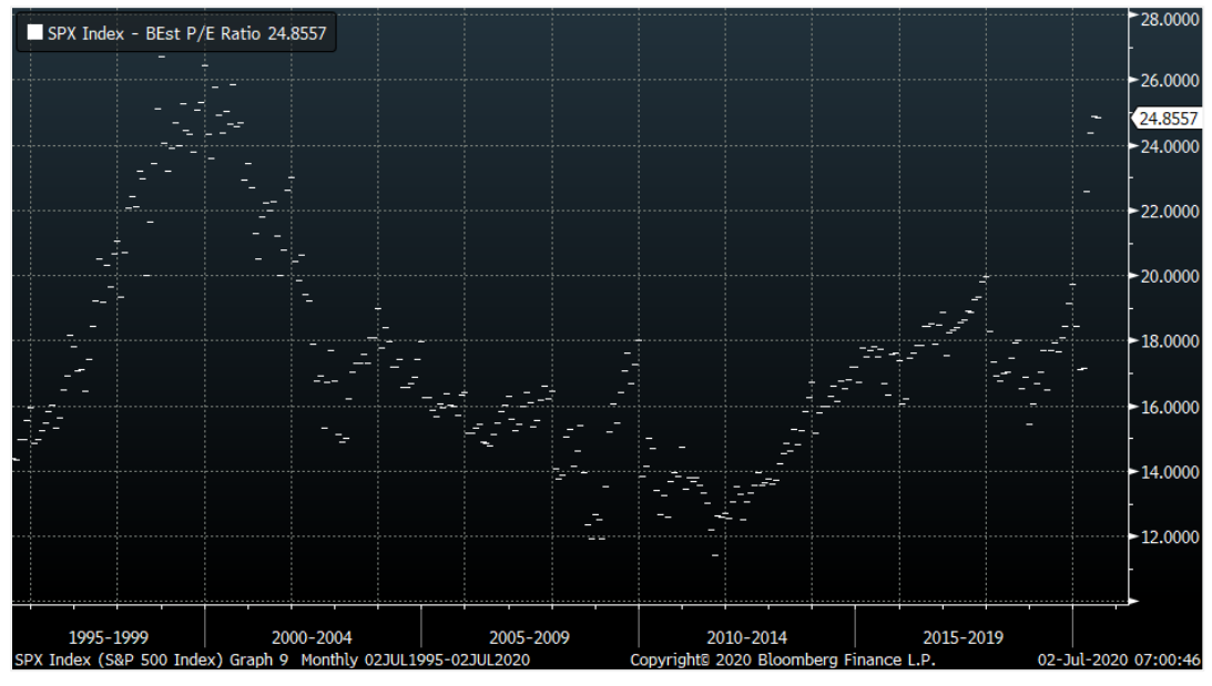
S&P 500 Forward P/E Ratio

the details of such purchases have since been released to show the Fed has been purchasing bonds primarily from blue-chip companies at record low interest rates, our sense is that the public and political backlash to such accommodation has only just begun, especially if the paper gains in asset prices do not soon result in real improvements in employment. While the prospect of higher Fed-fund rates is certainly unlikely in short to medium term, a shift towards removing this accommodation would likely be a difficult blow to markets that are in no position to absorb such a shock.