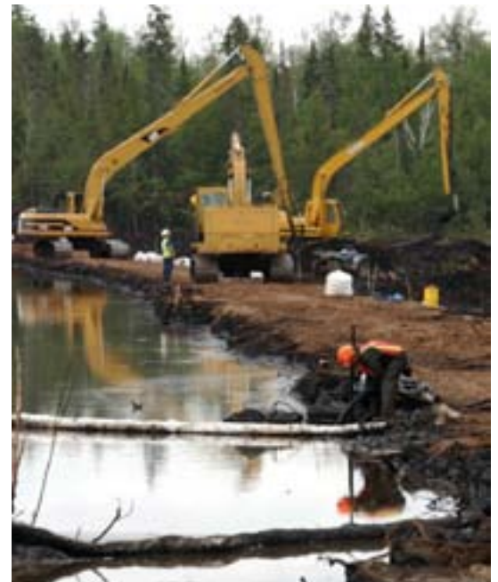
Enbridge oil spill in Cohasset, MN, 2002.

At the state level, there are no abandonment guidelines or definitions for intrastate crude oil pipelines. Any mention of abandonment of pipeline procedures follows the federal guidelines for disconnecting from active service and purging of any hazardous substance. If Enbridge is not required to remove the pipeline and restore the damaged ecosystems, there may never be a full accounting of the on-going and future contamination surrounding the pipeline.