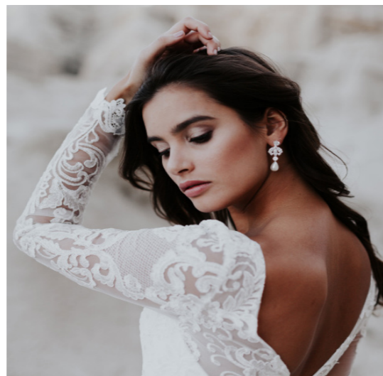
Victoria Comb AUD$299 Valencia Pearl Earrings AUD$249 Ashantha Fingertip Veil AUD$199