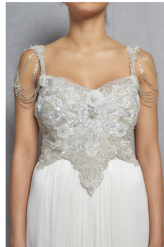
The Chloe dress with two Chloe Custom Sparkle piece placed along the bust line.