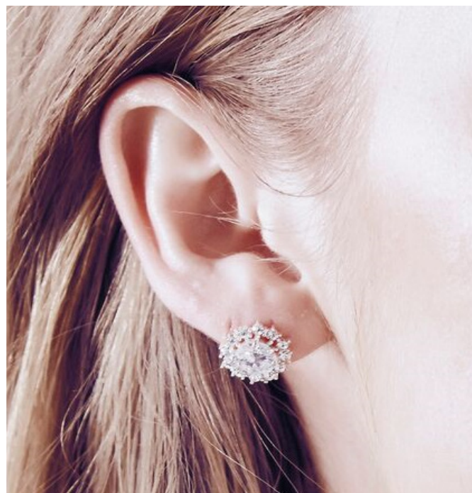
Valencia Stud AUD$149