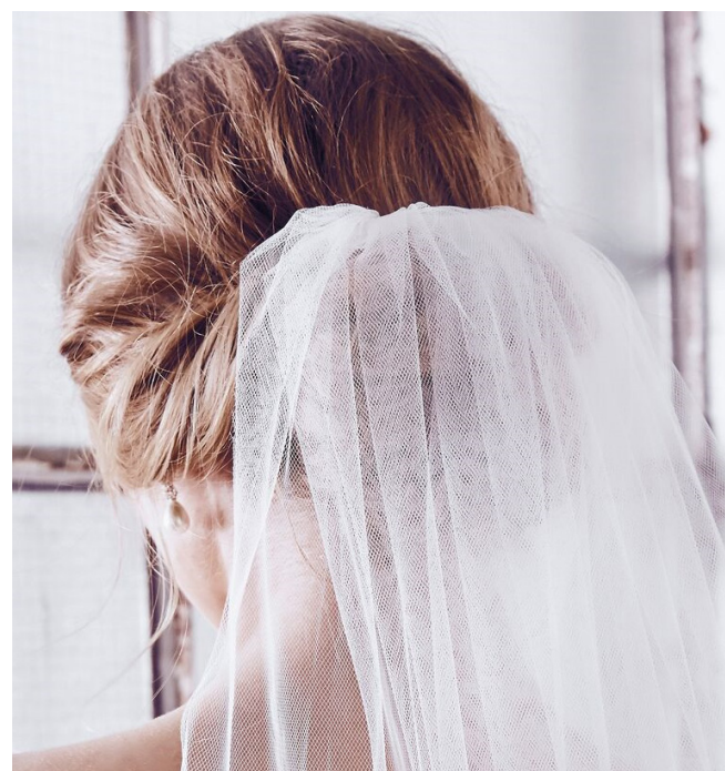
Zara Chapel Veil AUD$249