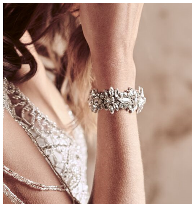
Flora Wrist Cuff AUD$229