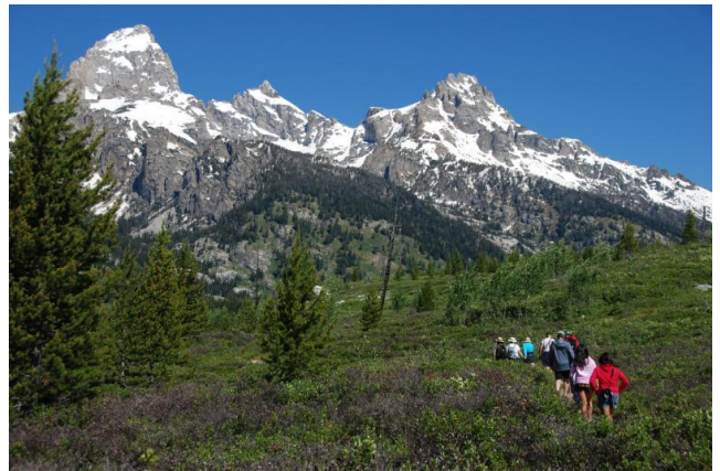
Hikers in Grand Teton NP

Established in 1929 and home to spectacular mountain scenery and wildlife, Grand Teton National Park has received over $40 million in LWCF funding to purchase inholdings within the park to bring cohesion to the landscape, reduce maintenance costs, complete wildlife corridors, and prevent non-compatible development. In 2016, a public-private partnership was implemented between the Department of Interior, Grand Teton National Park Foundation, and the National Park Foundation to prevent development of resort housing and trophy homes on one of the most significant viewsheds in the park. LWCF funds covered half of the $46 million purchase price, with private partners covering the remaining cost. In addition to preserving the integrity of the landscape, this project had significant impacts on water quality, wildlife habitat, migration corridors, recreation opportunities, and overall experience. However, additional funds are needed to complete the final purchase before the Wyoming School Trust Land is forced to sell to a private owner.