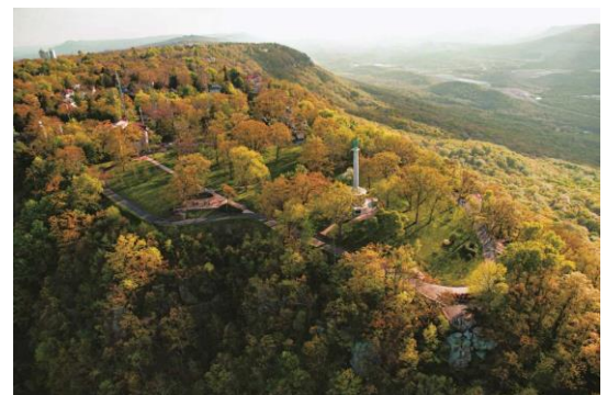
Lookout Mountain, Chickamauga-Chattanooga NMP

Created at the request of Civil War veterans in 1890, the Chickamauga-Chattanooga National Military Park protects important Civil War sites in and around the city of Chattanooga, including Lookout Mountain, Missionary Ridge, Moccasin Bend, and the Chickamauga Battlefield south of the city. LWCF investments of more than $10 million in recent years - through National Park Service land acquisition inside the park and using American Battlefield Protection Program grants outside the park boundaries - have ensured the permanent protection of important historic sites that are also part of Chattanooga's enviable network of open space. Protected lands that have benefited from LWCF funds include the sites of several key battles fought during a pivotal period in late 1863: Billy Goat Hill, where Union General William T. Sherman camped before the Battle of Missionary Ridge; a portion of the Wauhatchie Battlefield; and multiple properties on Lookout Mountain, site of the famed “Battle Above the Clouds.”