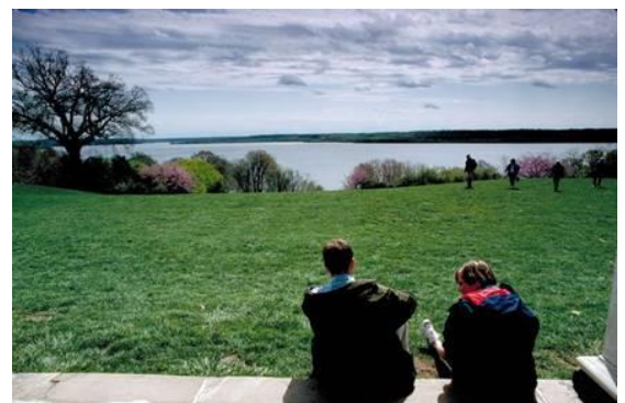
View from Mount Vernon

The view across the Potomac from Mount Vernon was first targeted for protection as a pilot project to safeguard parklands from suburban sprawl. Piscataway Park was conceived in 1952 to preserve the river view as it existed during George Washington's day. Since that time, numerous organizations have joined in partnership with the NPS to ensure the protection of the historic viewshed. Federal LWCF funding provided to Piscataway Park has allowed the NPS, the Mount Vernon Ladies' Association, private conservation groups, willing landowners, and other partners, to protect 232 acres of critical shoreline since 1995. Other area properties have been protected but several remain vulnerable to development.