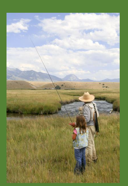
Fly fishing in Odell Creek, Montana