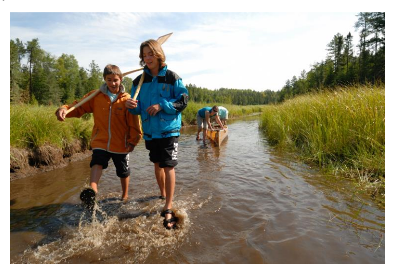
Recreation at Superior National Forest, Minnesota

Despite this uncertainty, LWCF has had positive conservation and recreation impacts throughout our country. Over its 50-year history, LWCF has protected land in every state and supported over 41,000 state and local park projects. The program enjoys strong bipartisan and popular support. A recent bipartisan poll found that an overwhelming majority - 82% - of voters support continuing to deposit fees from offshore oil and gas drilling into the LWCF. This broad support comes from every geographic region of the country, in red and blue states alike.