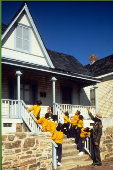
Student tour at Martin Luther King Jr NHS

LWCF is a simple idea: that a portion of offshore drilling fees should be used to protect important land and water for all Americans. These are not taxpayer dollars. Unfortunately, the promise of LWCF has been broken. The program is authorized to receive up to $900 million each year—but most of these funds have been diverted elsewhere. Now is the time to fix this and ensure that funds retained in the LWCF account are used for their intended conservation and recreation purposes.