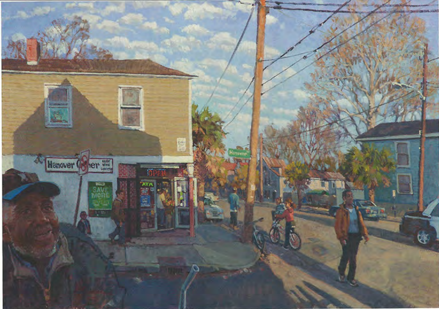
West Fraser (b. 1955) Talkin' about Spring 2013, Oil on linen, 30 x 40 in. Helena Fox Fine Art, Charleston