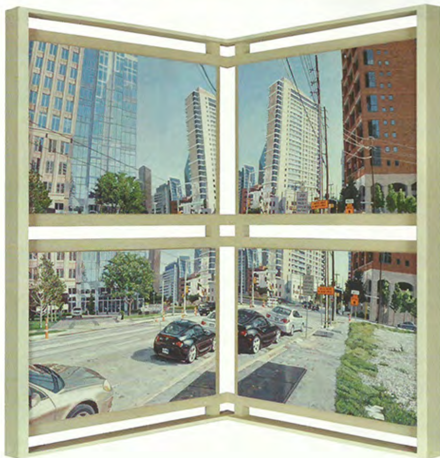
Lloyd Brown (b. 1957) McKinney at Harwood, Dallas, Texas 2012, Acrylic on four panels in integral frame 25 3/4 x 25 3/8 x 13 5/8 in. Valley House Gallery & Sculpture Garden, Dallas