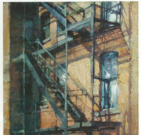
Jill Soukup (b. 1969) Orange Parceled 2010, Oil on board, 16 1/2 x 17 in. Private collection