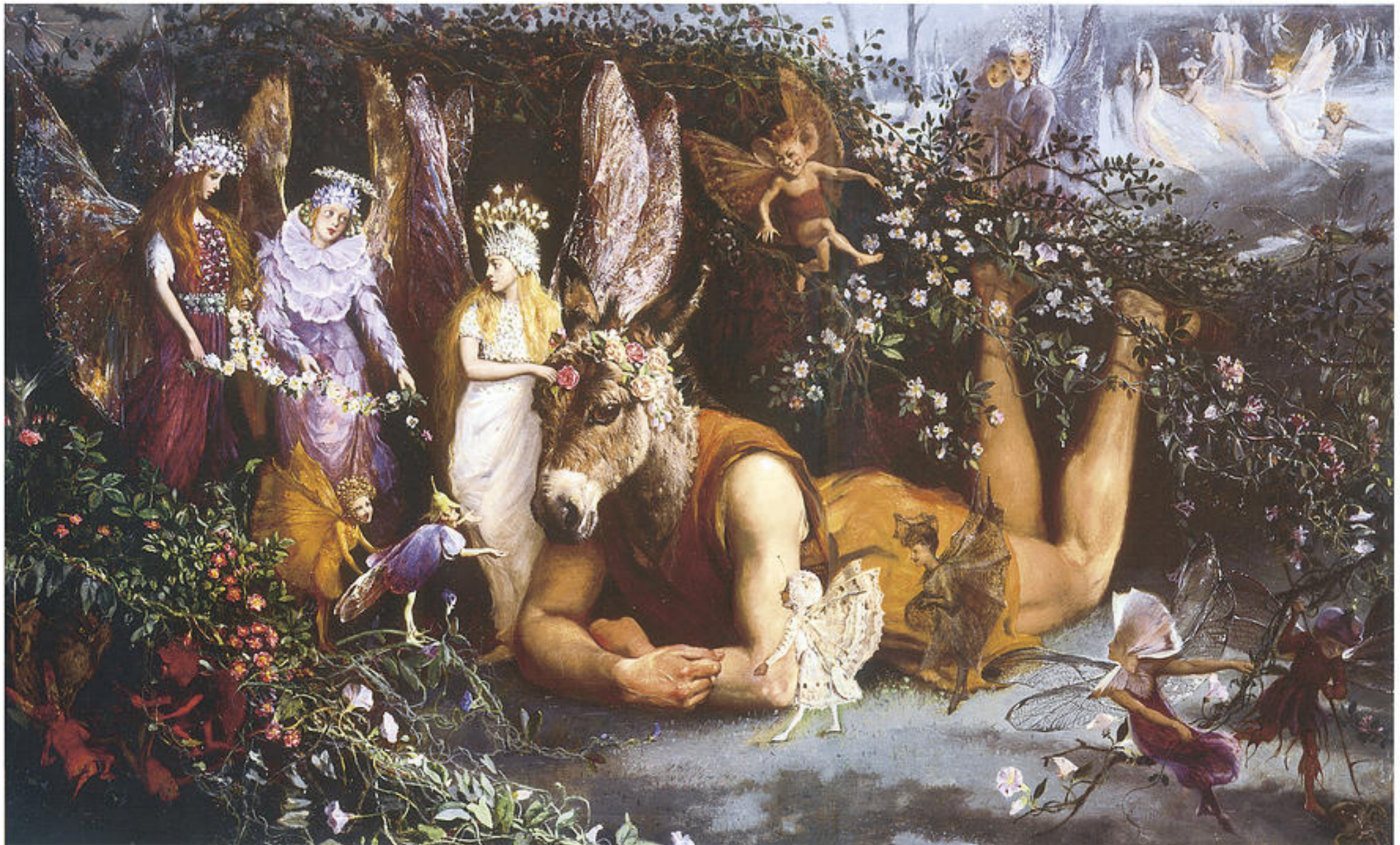
Program cover art: "Titania and Bottom" by John Anster Fitzgerald

Also in the woods, the king and queen of fairyland, Oberon and Titania, battle over custody of an orphan boy; Oberon uses magic to make Titania fall in love with a weaver named Bottom, whose head is temporarily transformed into that of a donkey by a hobgoblin or “puck,” Robin Goodfellow. Finally, Bottom and his companions ineptly stage the tragedy of “Pyramus and Thisbe.”