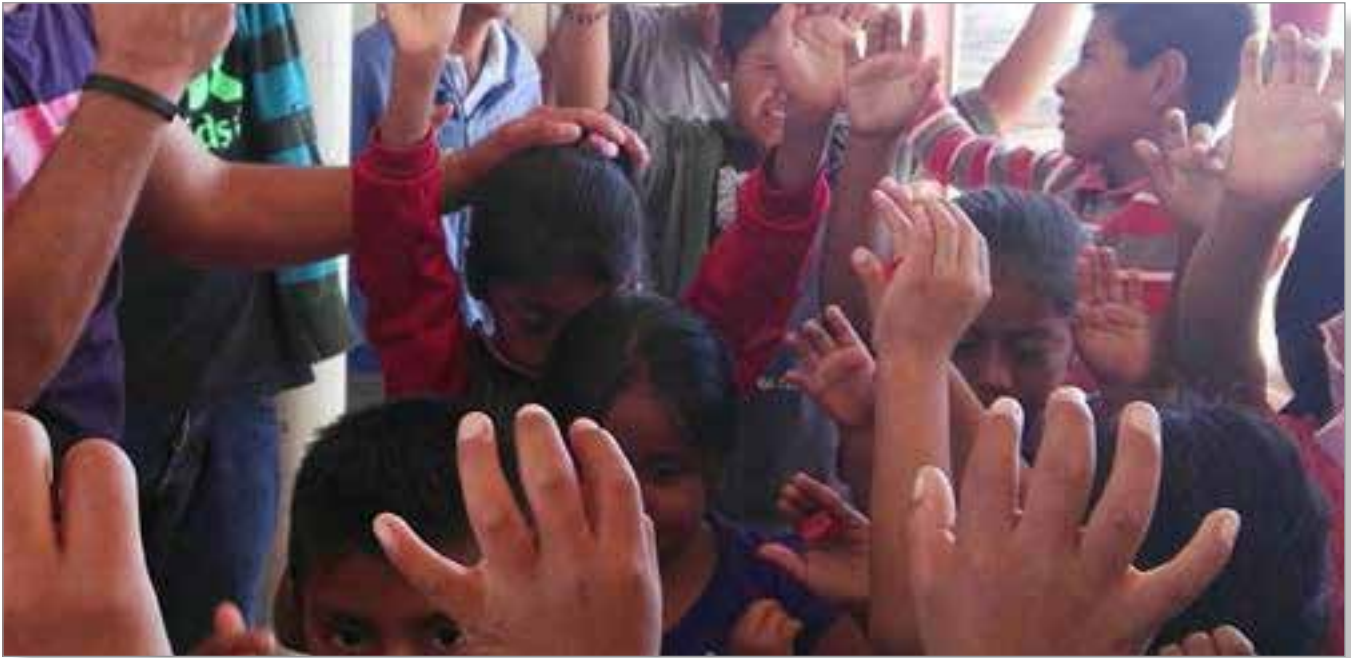
Amazing and Abundant Love

We have been able to have events of more than 800 children from outside the church in nearby neighborhoods and 700 children in events inside of the Mission Church.