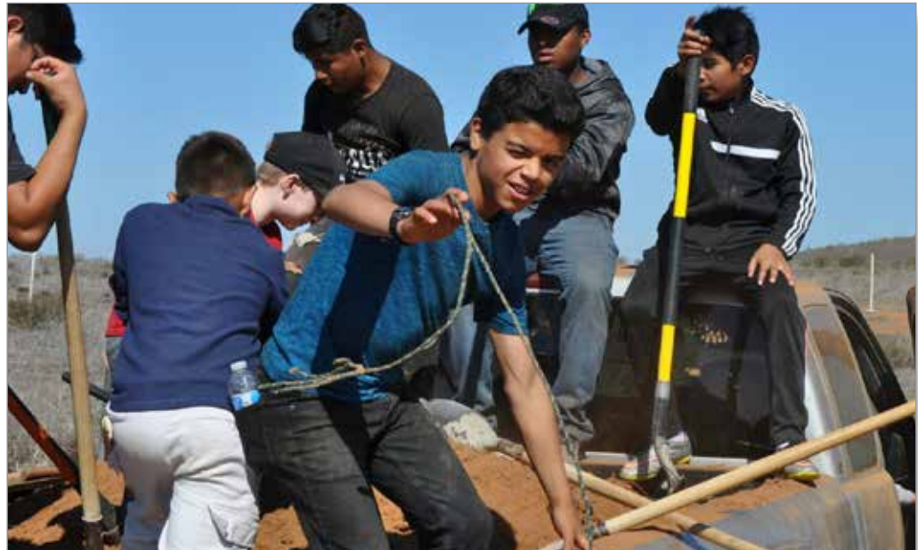
The Boys at The Ranch