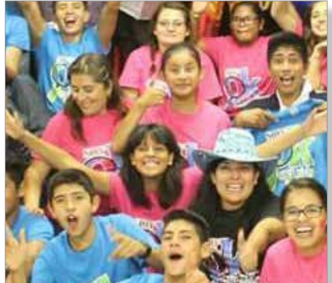
The OviKids Kids!

discover their spiritual gifts. Simply put, Ovikids is a seedbed of leaders. We firmly believe that children are not only the future, but they are also the present, which is why we formed a group we are calling "Ovi Command." It is a group of children whom we disciple to help