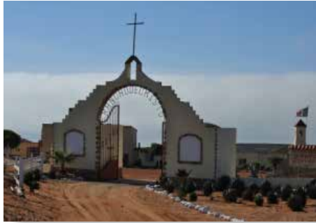
Rancho de Cristo