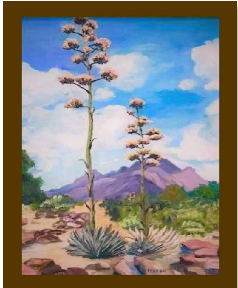
The Agave Painting

In February 1967 the hills of Baja were covered with Agave. Somehow I knew this trip was preordained; negotiations began toward the purchase of the mission property in Vicente Guerrero.