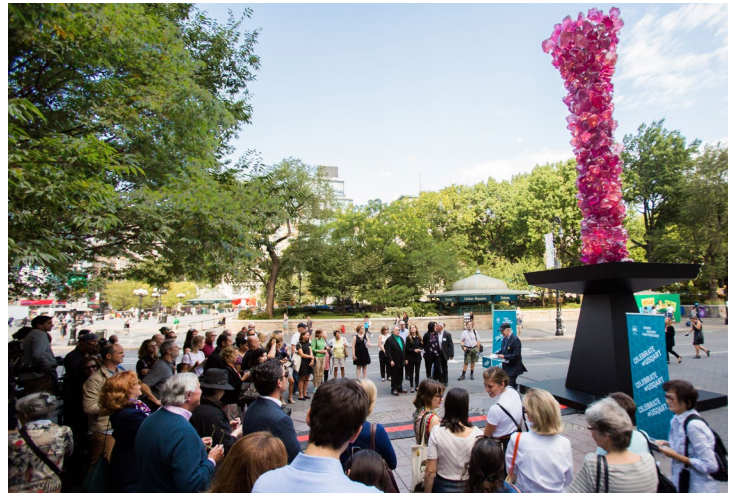
The opening of Chihuly’s Tower draws crowds to Union Square Park.

To celebrate autumn’s arrival, the Union Square Partnership (USP) welcomed Dale Chihuly’s Rose Crystal Tower to Union Square Park’s triangle along 14th Street in early October. The unveiling of Chihuly’s Tower is the latest in a series of public art installations spanning four decades that USP has brought to the Square as part of its Celebrate #USQArt Program. This stunning feat of engineering stands 31-feet tall and is composed of steel and 342 Polyvetro crystals, a plastic material that resembles glass and is more resilient for outdoor settings. The installation joins the long list of world-renowned art that has been featured in the district’s public art spaces, including Lionel Smit’s Morphous , Miguel Barcelo’s Gran Elefantret , and Rob Pruitt’s The Andy Monument to name a few. Chihuly’s installation was a collaboration between USP, the City’s Department of Parks & Recreation, and the Marlborough Gallery. It will be on display through October 2018 and is expected to draw hundreds of thousands of visitors to the Square over the next year.