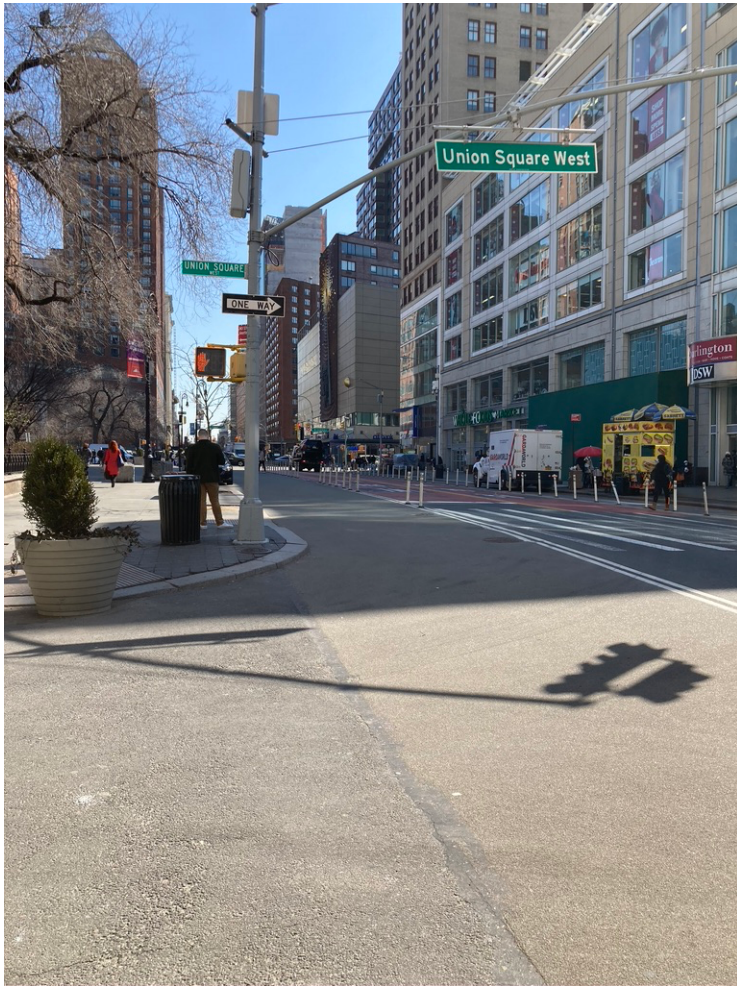
14th Street and Union Square West Looking East