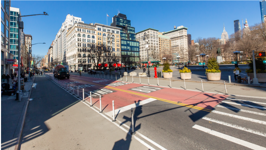
14th Street between University Place + Broadway Looking West