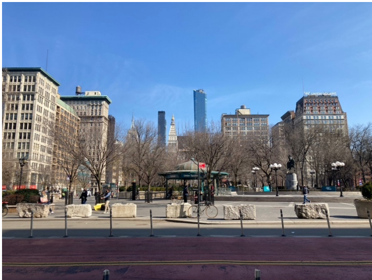
14th Street Between University Place and Broadway View North