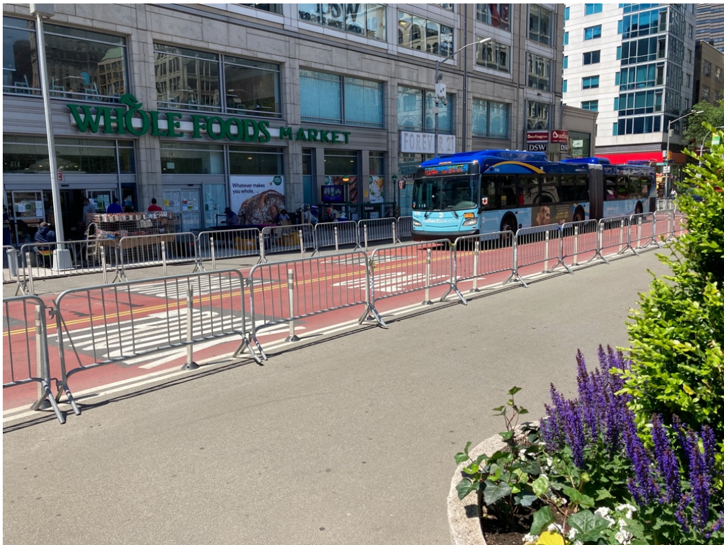
14th Street Between Union Square West and Union Square East Looking South