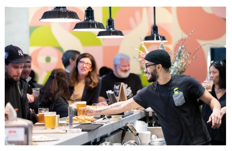
Zero Irving's 10K SF ground floor food hall, operated by Urbanspace, includes 13 vendors across a mix of cuisines, 25% of which represent first-time entrepreneurs or start-up companies. In February 2023, the food hall was featured in PureWow's "11 Union Square Restaurants Every New Yorker Should Try."

"Because we're located in the heart of the NYC tech community, Civic Hall @ Union Square's six floors of state-of-the-art training and conference center space at the new Zero Irving building will drive sustainable pathways to high-tech jobs. Civic Hall will help supply the tech workforce and spur innovation for industry leaders, the community, the City of New York, and beyond."