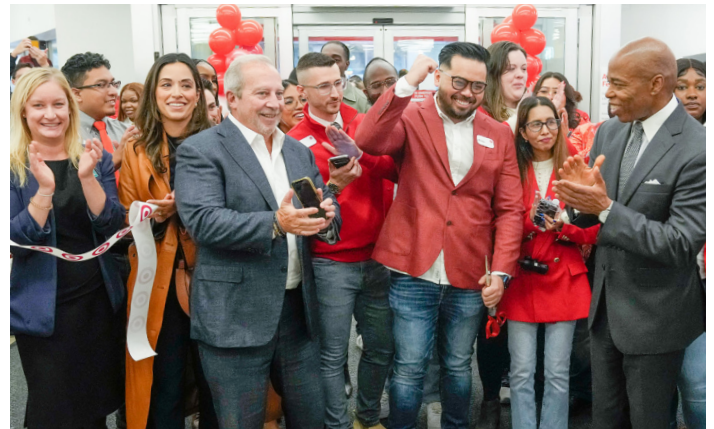
Union Square Partnership joined Mayor Eric Adams, Councilmember Carlina Rivera, and community members to celebrate the grand opening of the new Union Square Target store on Tuesday, October 17, 2023.

Average weekday pedestrian counts at key entrypoints to Union Square, based on USP manual survey Wednesdays + Thursdays from 8 AM-7 PM in September 2023. According to additional data from Exteros, the highest average foot traffic in Union Square in Q3 was observed on Fridays, from 2-4 PM. * Source: Replica. Avg daily trips within the Union Square-14th Street District Census Tracts.