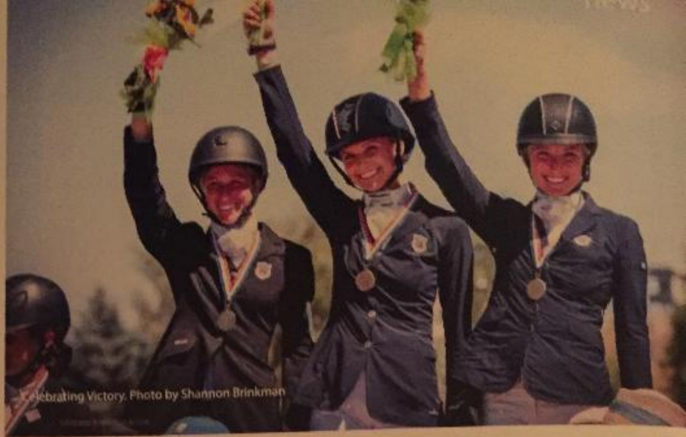
Celebrating Victory.