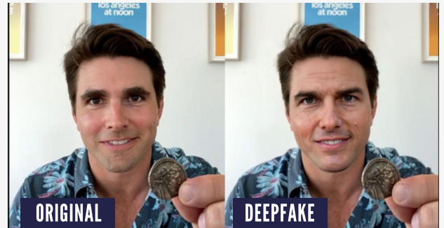
DEEPPFAKE TOM CRUISE

These videos use face-swapping technology to transfer a victim's face from a photo or video onto the body of someone else in a pornographic video, making it falsely appear the victim is engaging in sex acts. To safely see how this technology works, click here to watch this explainer video created by Facebook.