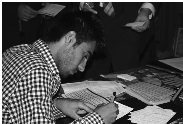
Figure 3.3. An Iraqi scholarship student prepares his document for admission

The scholarship programs are also taking steps to improve students' levels of English. The English Language Institute opened in October 2013 in Baghdad to provide language instruction to 500 HCED and MoHESR scholarship recipients each year. With a $1 million grant from the U.S. Government, Ball State University is developing the curriculum, training