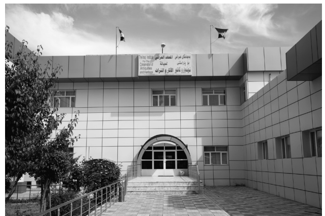
Figure 4.1. The entrance to the Iraqi Institute for the Conservation of Antiquities and Heritage