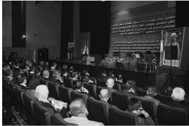
Figure 5.1. Opening ceremony, “Kurds and Kurdistan” conference, Salahaddin University, Erbil, 16 April 2013

The panels held at the Salahaddin University campus over the next days were organized both thematically and by language, with presentations in Kurdish, English, Turkish, and Arabic on very diverse subjects covering Ottoman and Western travel literature on Kurdistan, Diyarbakir