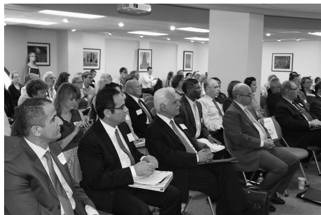
Figure 3.2. Higher education officials from Iraq (front row) participated in the U.S.–Iraq Higher Education Conference with more than 100 U.S. university representatives

An old adage attests to the strong commitment Iraqis have to education: Cairo writes, Beirut prints, Baghdad reads. In the last few years, those efforts have intensified and today there are three major programs awarding thousands of scholarships each year to send top students abroad. The goals of the three programs are similar: to improve the capacity of the higher education systems in Iraq by ensuring top students and university faculty earn advanced degrees abroad; build connections with the international