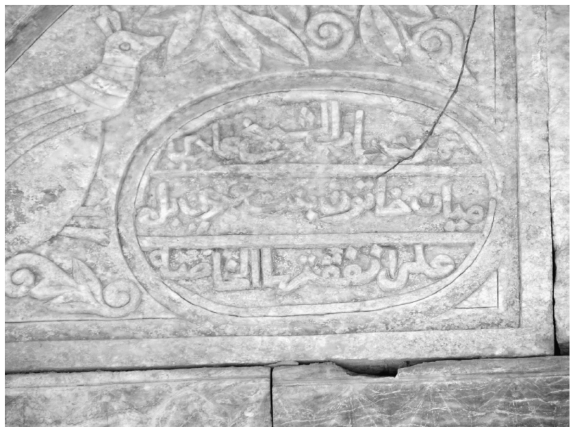
Figure 5.5. (Below) Tomb at Shaykh 'Adi shrine, Lalesh, 19 April 2013