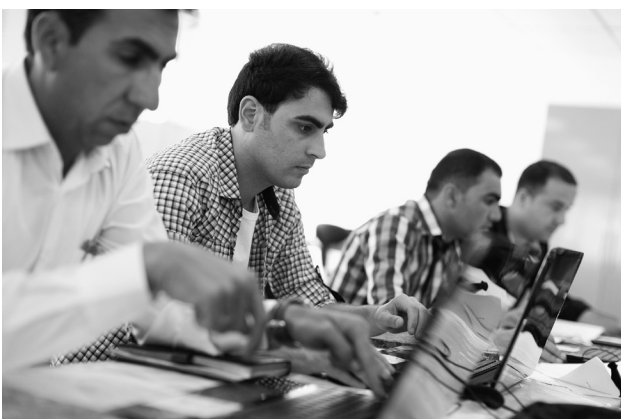
Figure 4.3. Students in the Archaeological Site Preservation program learning the basics of GIS