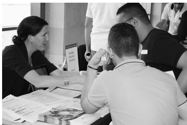
Figure 3.1. U.S. universities recruit Iraqi scholarship students at EducationUSA Fair in Sulaymaniyah

To illustrate the importance of strengthening educational cooperation between the two countries, the Department of State also created a new position in Washington, D.C., to increase the capacity of the scholarship programs. As the Education Specialist for Iraq, I work to increase the number of Iraqi students studying in the United States, strengthen the scholarship programs, and assist U.S. universities in recruiting and retaining Iraqi scholarship students. Much of my time is spent helping the scholarship programs and their representative offices in Washington, D.C., design policies and identify partnerships that will benefit institutions in both countries. I also act as a resource for U.S. universities that want to recruit Iraqi scholarship students and engage with Iraqi universities, but need support to make that happen.