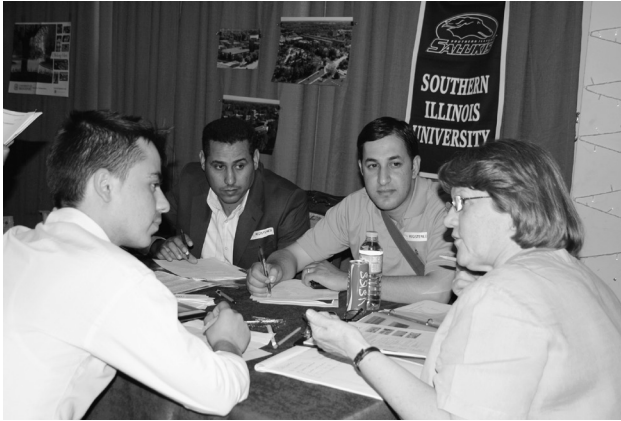
Figure 3.4. A U.S. university admissions official discusses doctorate research proposals with scholarship recipients

Iraqi English language teachers, and teaching ESL to scholarship students. The Prime Minister's Office is rehabilitating the facilities inside the International Zone.