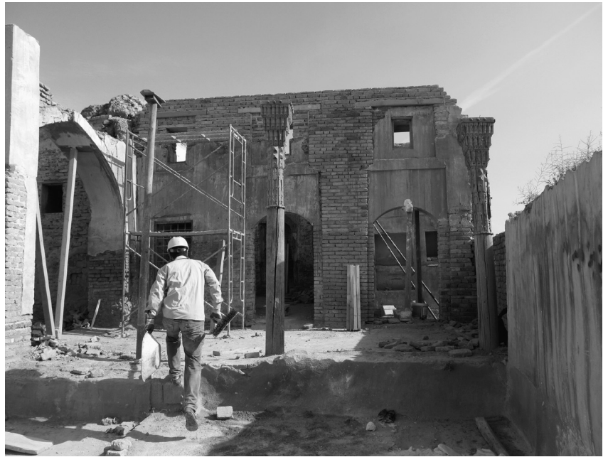
Figure 5.4. (Left) Shrine of Shaykh 'Adi, Lalesh, 19 April 2013