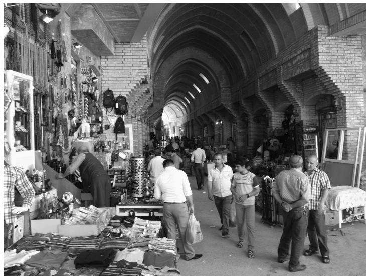
Figure 5.2. Erbil market, 15 April 2013

Both the organizers and sponsors are to be commended for providing this unique occasion to further the field of Ottoman Kurdish studies; the success of their efforts is shown by the fact that preparations are already under way for the second academic conference on Kurds and Kurdistan in the Ottoman period to be convened at Mardin Artuklu University in 2014.