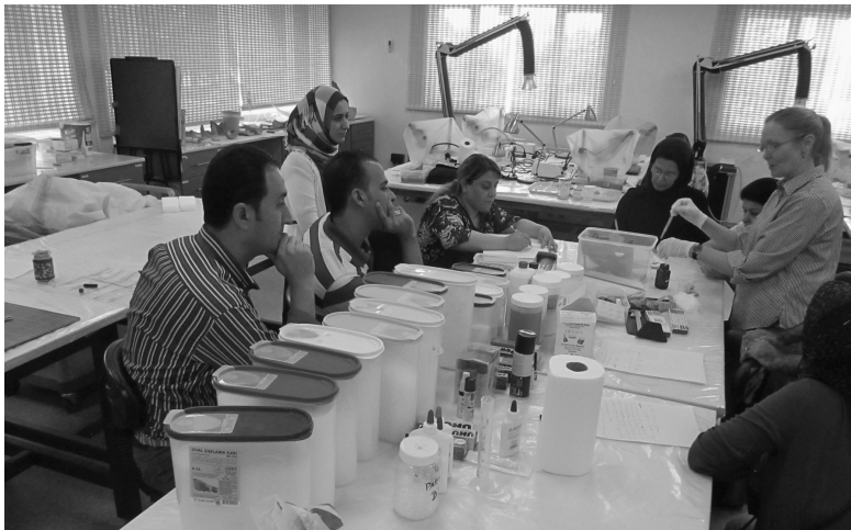
Figure 4.2. Students and teachers in the Advanced Conservation course discussing ideas in one of two Iraqi Institute laboratories

archaeology at Salahaddin University in Erbil. 3