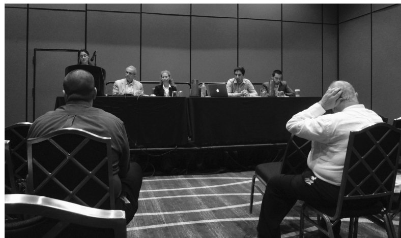
Figure 2.1. A TAARII-sponsored panel at MESA 2013 explored the relations among minorities, identities, and the modern Iraqi state

The goal for this panel was to contextualize Iraq's minority communities within the social and political history of the modern state, and to highlight the ways in which minorities and the Iraqi state interacted with each other. The panel intended to help scholars better understand the historical developments that led to the creation of Iraq's multiple identities.