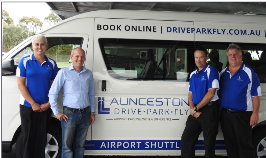
Launceston Drive Park Fly NMBA Leading Business Member