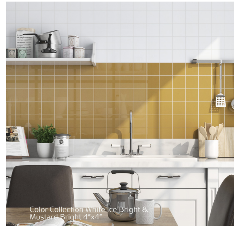
Color Collection White Ice Bright & Mustard Bright 4"x4"