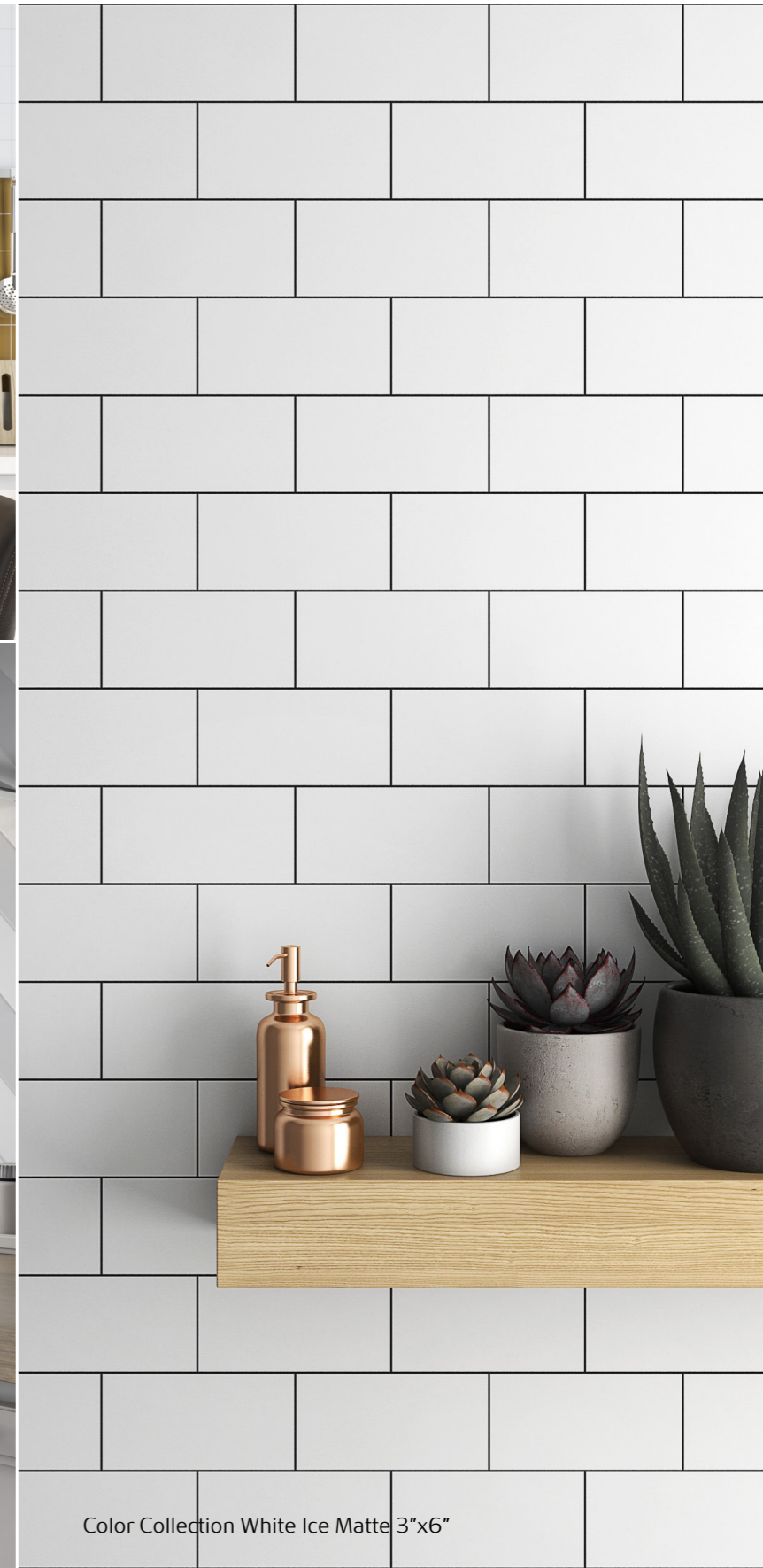
Color Collection White Ice Matte 3"x6"