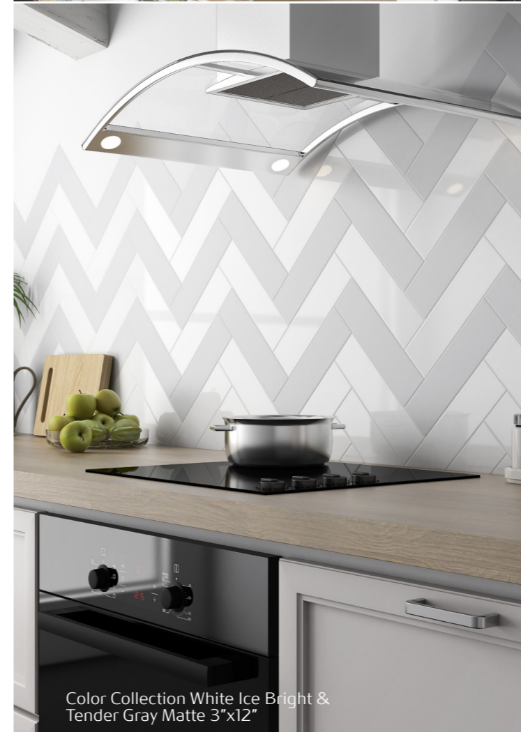
Color Collection White Ice Bright & Tender Gray Matte 3"x12"