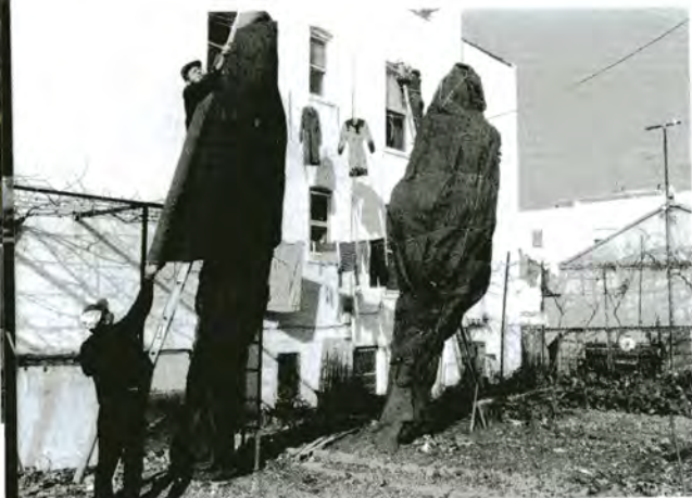
From Found in Brooklyn