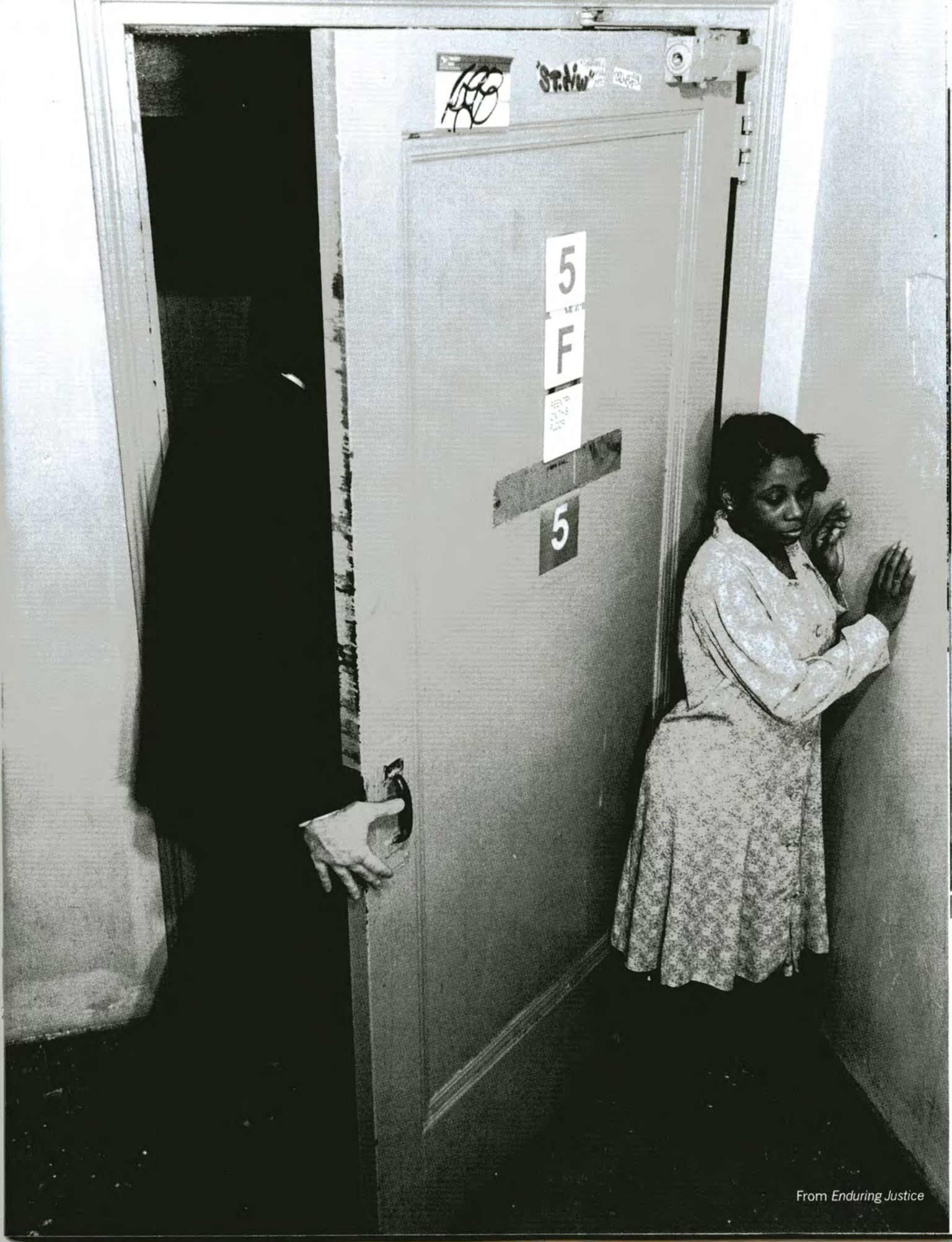
From Enduring Justice