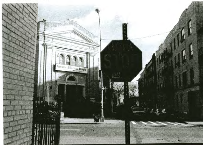
From On Three Pillars