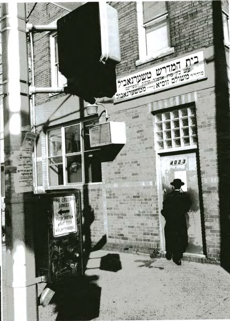
From On Three Pillars

Roma printed many of the pictures in the exhibition on a lightweight photographic paper stock called thesis paper. Unlike conventional photographic paper, thesis paper does not have a bright white baryta layer beneath the light-sensitive photographic emulsion layer. The resulting printed image has a luminous quality, as though light were