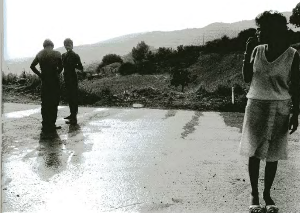
From Sicilian Passage