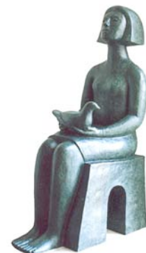
Blind Girl with a Bird , bronze, 2000