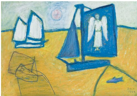
Sailing to Byzantium: Drying Her Wings , mixed media on paper, 1999