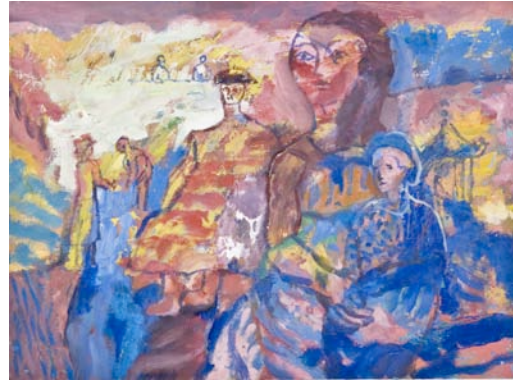
Pagoda , oil on board, 2002