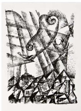
Landscapes of Childhood: Battle of Britain (detail), 1958