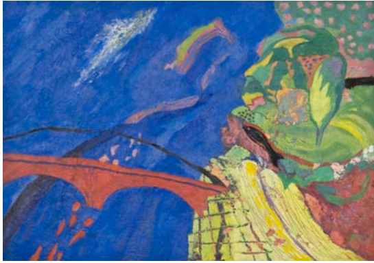
Red Bridge , oil on board, 2006