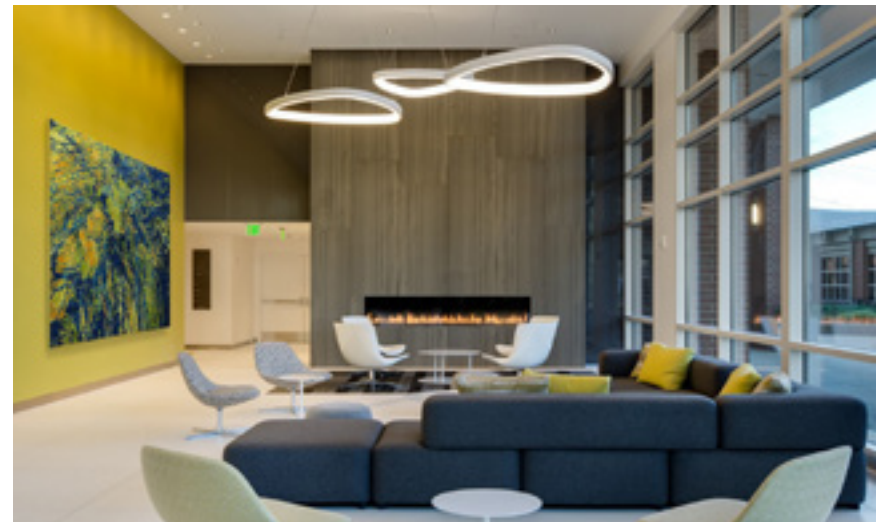
BioMed Realty, Hampshire Street, Cambridge, MA