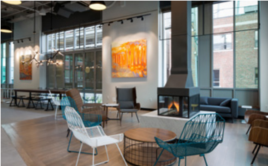
BioMed Realty, 40 Erie Street, Cambridge, MA

“The artwork in the lobby looks fantastic and we are appreciative of Art in Giving’s efforts in making it a success. We look forward to continuing our special partnership.”