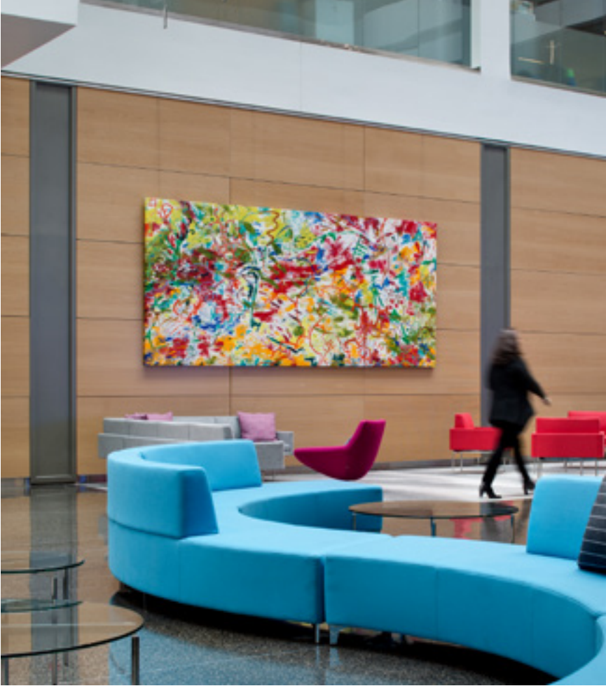
BioMed Realty, 650 Kendall Square, Cambridge, MA

PLEASE VISIT OUR ONLINE GALLERY AT www.artingiving.org