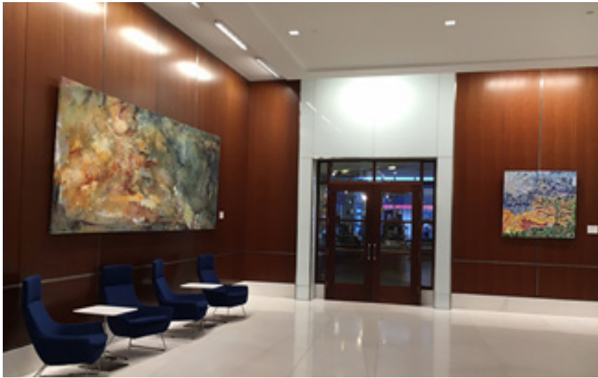
Equity Office, 100 Summer Street, Boston, MA