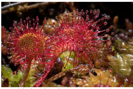
Round-leaf sundew

at the eastern side near the small boardwalk leading out to the Marsh. Here you can find the tiny, jewel-like carnivorous round-leaf sundew, which gets nutrients by digesting insects that it captures in its sticky tentacles. Other beautiful plants in this part of the Marsh include yellow swamp candles