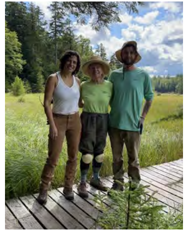
Volunteers and seasonal staff at the Hidden Marsh

Today the Marsh has four distinct plant habitats: 1) a bog-like peat forming wetland