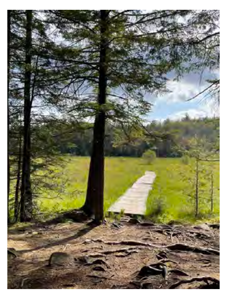
Hidden Marsh Boardwalk

This is the kind of generosity I've seen so many times since joining the Arboretum, and for that, I thank you. I look forward to sharing more updates with you throughout 2024!