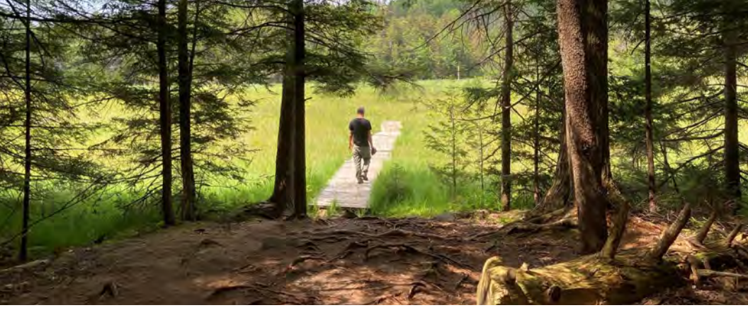
Volunteers and seasonal staff at the Hidden Marsh