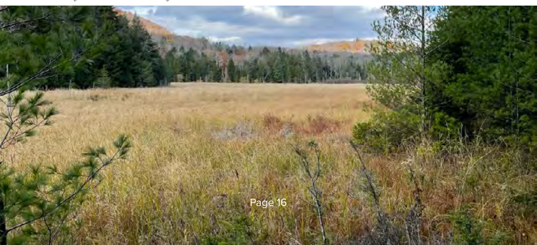
View of the Hidden Marsh from the boardwalk

sharing and protecting it for so many generations to come. This land will serve both future generations and the planet with its beauty, natural carbon capture and the habitat it provides for wildlife. It's our hope that this gift inspires others to consider supporting and growing those organizations in their own backyards that protect and conserve our natural environment."