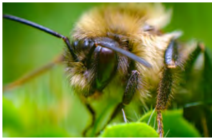
Bombus borealis

red-winged blackbird, swamp sparrow, and common yellowthroat are among the many birds spotted at the Arboretum that would use this wetland for nesting habitat. Amphibians and reptiles found here during the 2018 survey include spotted salamander, eastern red-spotted newt, garter snake, milk snake, and several species