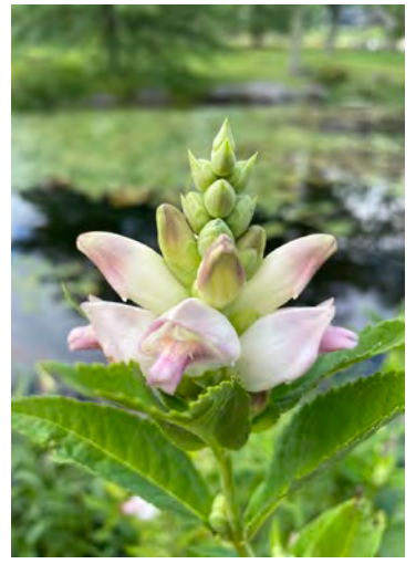
Turtlehead in bloom