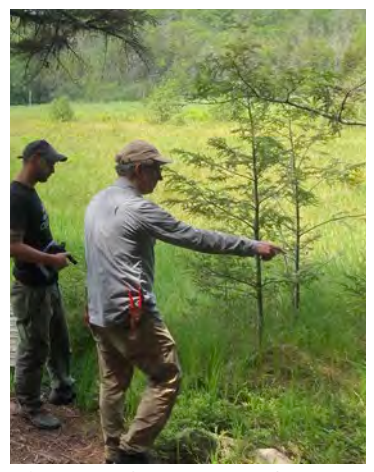
Planning and conservation efforts continue at the Hidden Marsh

Spatterdock Darner and Forcipate Emerald.