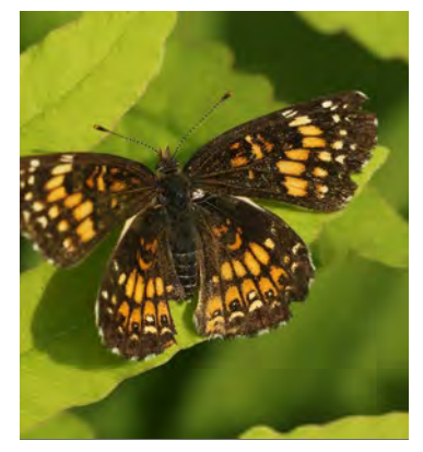
Harris' Checkerspot butterfly