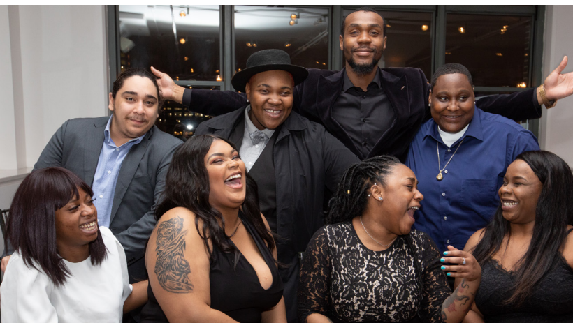
Members of the CASA-NYC Youth Leadership Council, launched in July 2018.