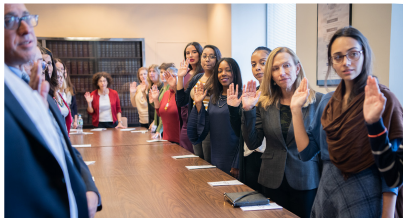
New volunteer Advocates taking the Oath of Confidentiality.