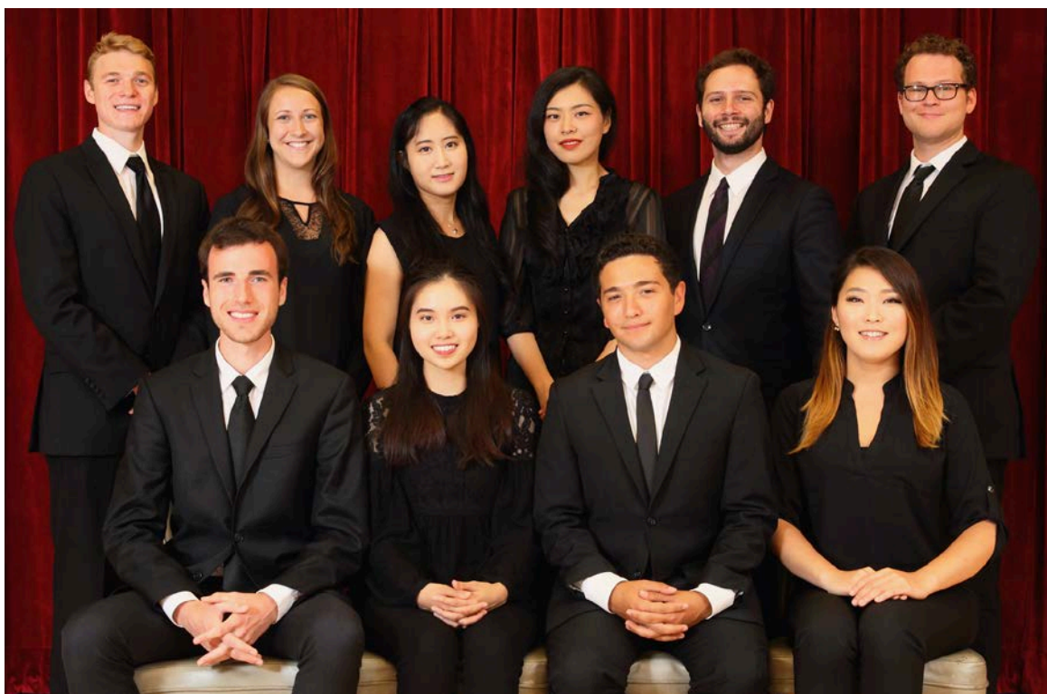
2018 Zarin Mehta Fellows.

Santa Barbara, CA — Ten outstanding Music Academy of the West musicians have been selected to travel to New York as Zarin Mehta Fellows in January 2018 to participate in the fourth year of the New York Philharmonic Global Academy Fellowship Program, which offers opportunities to train and play with Philharmonic musicians, representing an innovative approach to training the next generation of world-class musicians for successful careers.