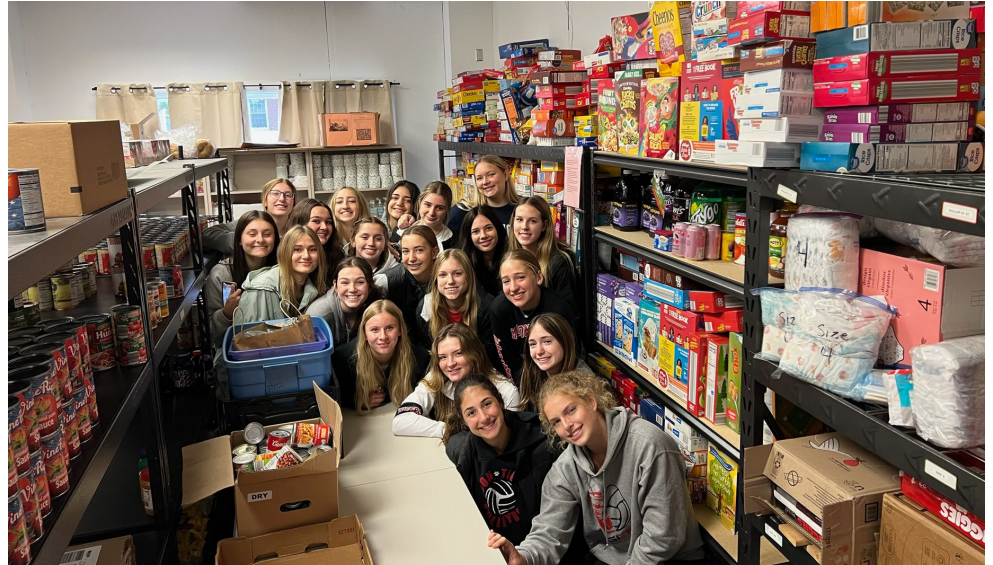
The Moon Tigers Lady Volleyball team donated an incredible 938 boxes of cereal to the Coraopolis Food Pantry