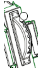
Rope speed Selector

Light headedness and dizziness can be signs of over-exertion or other medical conditions. If this occurs, STOP using the machine immediately and consult a physician. Always rest between sets.