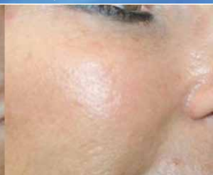
AGE 49, POST-FOREVER YOUNG BBL