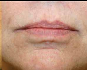
AGE 67, POST-FOREVER YOUNG BBL