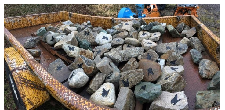
Figure 2. Engraved rocks in gateways

There is concern that the preliminary concept does not reflect the family members' wishes that the individual memorial area not be graveyard-like or sad. The desire is that this area celebrate the individuality and happy memories of those that were lost. Further, there is interest in incorporating representation of butterflies within the panels to be reflective of the use of butterfly outlines in the two gateways to the Slide Memorial.