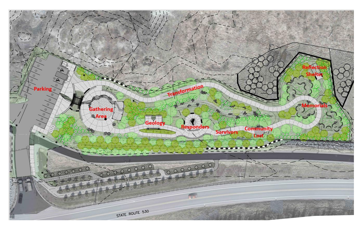
Figure 3. Memorial layout