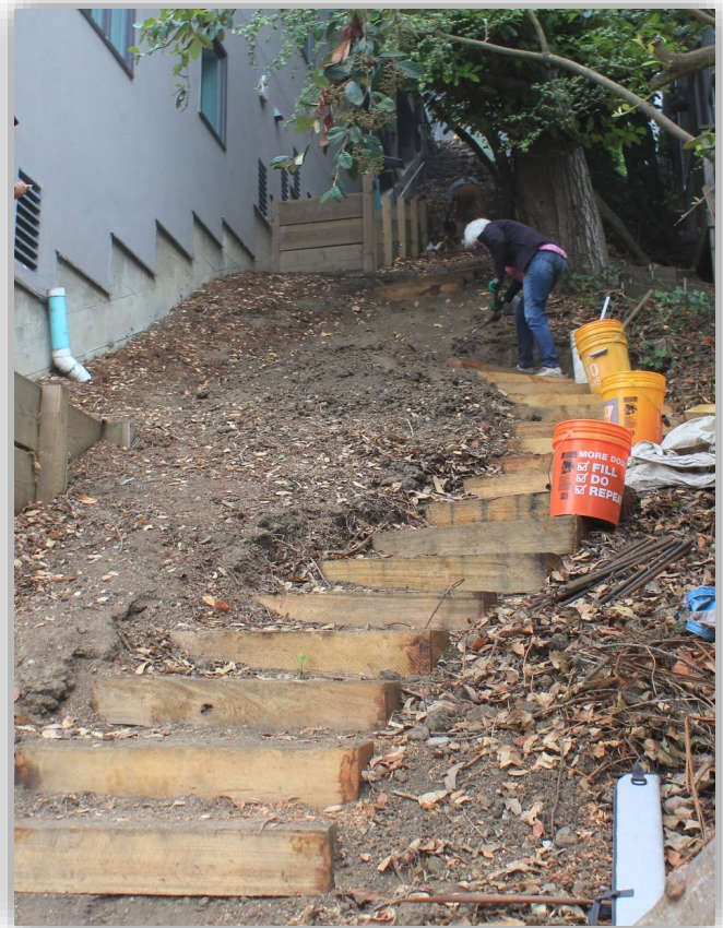
BPWA volunteers building a new path: Lower Halkin Walk (August 2020)

The enclosed is a report on what remediation is needed to bring the path network into good condition. The findings are largely based on a field survey that BPWA organized on July 22, 2018. On that day nearly 80 volunteers fanned out all over the city and, clipboards in hand, walked all the paths and recorded their condition (signage, steps, handrails, overgrowth, etc.). The report is a living document; it is periodically updated to reflect progress made since the time of the July 2018 field survey. Going forward, we plan to conduct all-paths surveys once every five years.