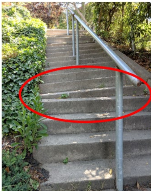
Uneven/ broken steps on concrete path