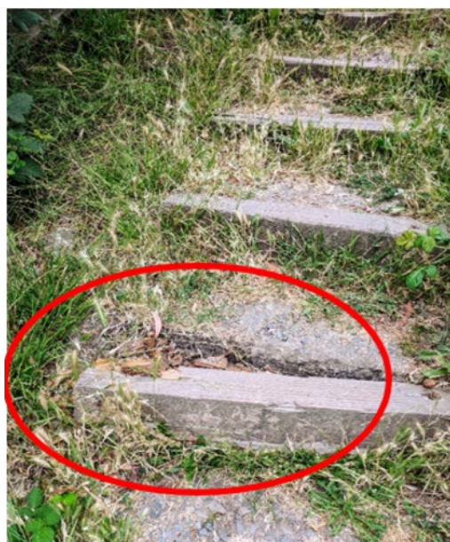
Broken step on landscaped path