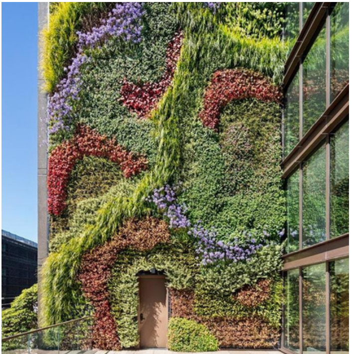
Photo: Habitat Horticulture Exterior Living Wall at 2177 3rd St. in San Francisco, CA.