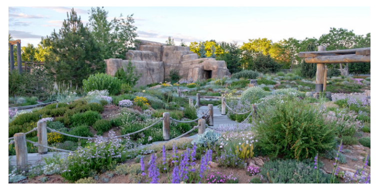
The mixed intensive-extensive green roof at Denver Botanic Gardens.

Increase in property values with a corresponding return in property taxes to the city