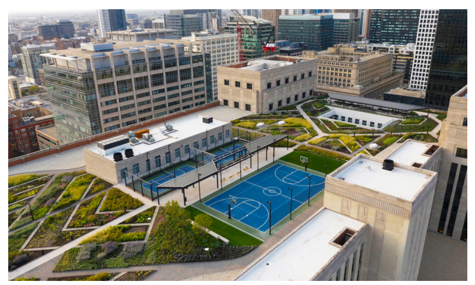
The Old Chicago Post Office in downtown Chicago