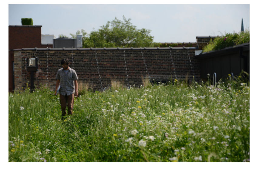
Carroll Rooftop Farm, Chicago, IL.

In this age of significant public resource constraints, and growing challenges, green roofs and walls provide proven approaches to meeting multiple policy objectives at minimal cost, and can contribute over time, to helping make our communities more resilient.