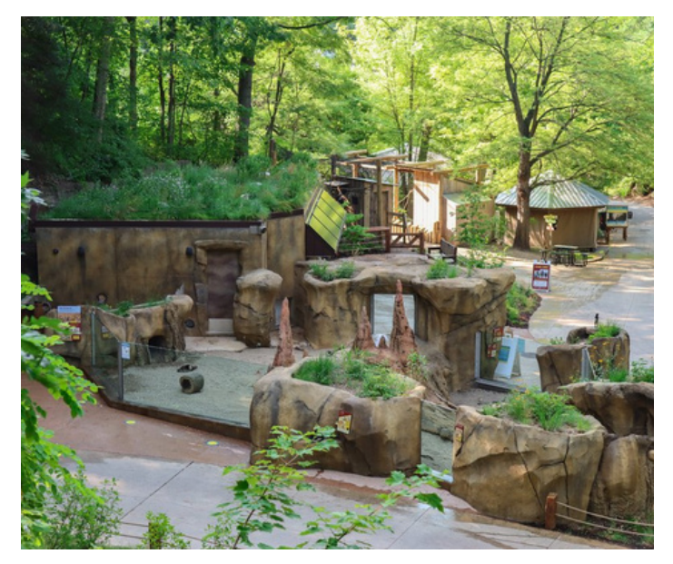
LAPT Platinum Certified green roof at the John Ball Zoo in Michigan

The likely arguments against green roofs are generally predictable and typically centered around cost and technical issues. Stakeholders should be identified at the beginning and early outreach should anticipate such concerns, and be prepared to address them as they arise, regardless of the form of public process.