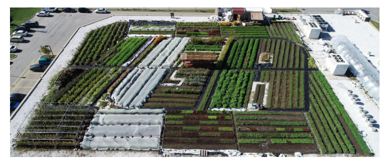
IGA rooftop farm, Quebec, Canada.