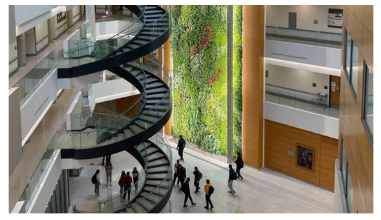
A living wall in Drexel University, Pennsylvania.

Living walls are systems that use felts, or containers that support plants with or without growing media which attach to a secondary frame attached to the building envelope. They employ a wider variety of plants than green facades.