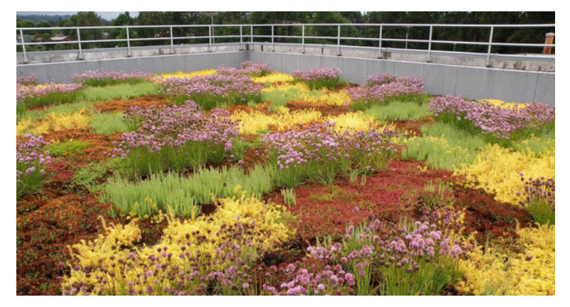
The extensive green roof at the Tri-City Water Resources Recovery Facility - Oregon.

As the growing media thickness gets deeper (8 – 48 inches), intensive green roofs successfully support a very wide array of plant species and sizes including full size trees. Very often intensive green roofs are combined with other features such as pedestrian and amenity features to increase the usability of these rooftop environments.