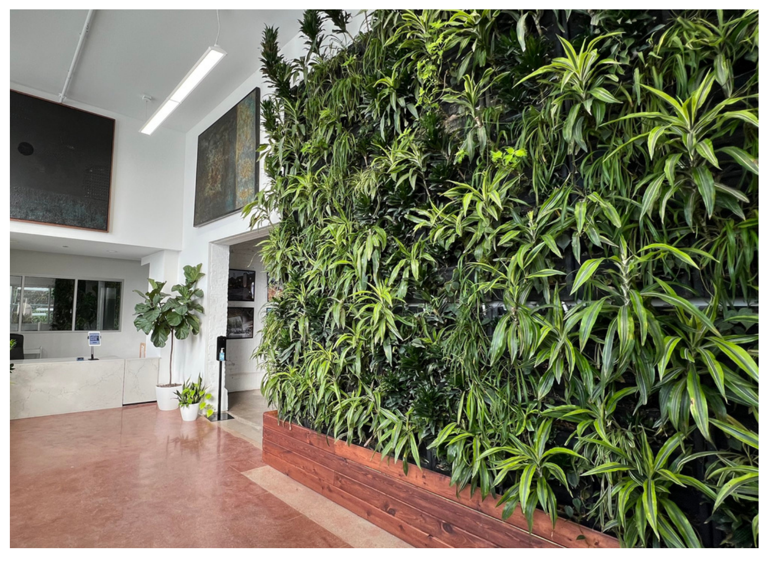
The lobby of Hatch 41, Chicago, IL.