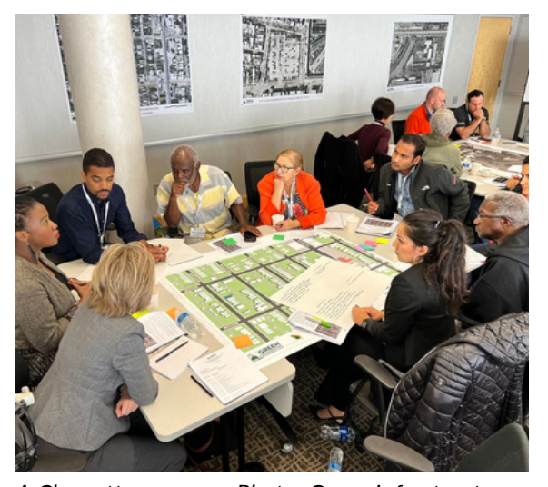
A Charrette program.

The <u>Green Infrastructure Foundation</u> (GIF) is the charitable arm of Green Roofs for Healthy Cities. It has an independent board of directors. It supports policy development through community engagement, training and research.