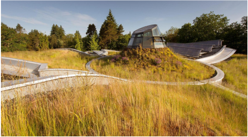
Van Dusen Botanical Garden Visitor Centre 2017 by Connect Landscape Architecture Inc. with Architek.

These green roof types retain and detain stormwater within an enhanced green roof section by augmenting the growing media with synthetic materials that act like sponges in the green roof. Unlike Blue Roofs, stormwater in a Blue/Green Roof is held in the pore spaces in the growing media and synthetic elements and released via transpiration and evaporation from the plants within the Blue/Green green roof assembly.