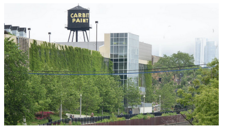
The Shoppes at Kingsbury Square, 2014

Facades are a structured system of stainless steel cables or grids that support climbing plants growing in planters from a planter bed, supported by a wall or other structure element or directly in the ground.