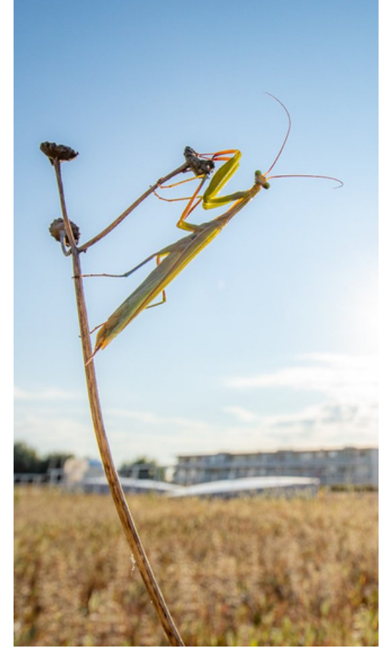
Carbon Sequestration Strategy

A proposal for legally binding EU nature restoration targets to restore ecosystems and help to increase biodiversity, mitigate and adapt to climate change, and prevent and reduce the impacts of natural disasters. The European Commission proposed a <u>Nature Restoration</u> <u>Law</u> and in that framework it proposed unprecedented legally binding urban biodiversity targets. Such targets are intended to boost a systematic integration of vegetation into urban planning, including in public spaces, infrastructure, and in the design of buildings, in particular of their roofs and facades, and their surroundings. England adopted a new policy in 2022 requiring new development to provide a net gain or improve biodiversity over existing conditions. Vegetated roofs will play a starring role in this effort.