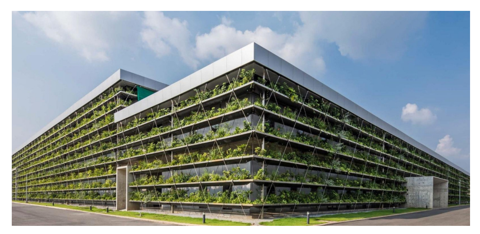
Multi-story green facades around an inner courtyard, Jakob Rope Systems, Vietnam.

It is recommended to seek feedback from other municipalities who have generated policies and regulations, as well as attempt to achieve early support from stakeholders. In 2017, Denver passed the Green Roof Ordinance after a citizen-led effort advocated for green roof policy. The ordinance mandated green roofs on both new and existing buildings. The requirements for green roofs on all existing buildings were particularly concerning to some constituencies, and led to well-organized and funded opposition to the initiative. Following passage, a technical committee was convened to adjust the requirements mandated by the sweeping initiative. Over the course of that process, it was determined that green roofs are not a feasible option for 95 percent of existing buildings because they would be unable to support the extra loading requirements. This opened the initiative language to a fundamental reworking, and it was ultimately amended to now mandate that buildings have a cool roof and one of a series of compliance options, of which installing green roofs or walls are included. The complicated array of options in Denver comes with an immediate cost: staffing to administer the ordinance is multiples greater than other cities with clear codified mandates. This added cost also makes the program vulnerable to future budget processes in leaner times.