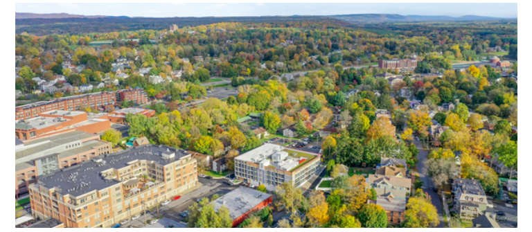
Moderne, Saratoga Springs, NY.

Green roofs have the ability to retain stormwater through the plants, growing medium and additional layers that capture and hold, or slow the progress of water off a roof. Many jurisdictions recognize green roof assemblies for their stormwater retention benefits through stormwater regulations. In recent years, manufacturers have begun introducing green roof systems that enhance the stormwater retention capacity of green roofs, often through the use of cups in the drainage layer, fabrics or fleeces that expand to hold more water. They are also incorporating systems that allow for the detention of stormwater (typically up to 6 inches in depth) for a period of time, often two to three days, before controlled release. The detention capacity gives civil engineers a greater degree of certainty over stormwater management than retention alone. Managing stormwater on roofs, can save developers costs associated with below grade or underbuilding stormwater detention structures and the space and mechanisms they require.