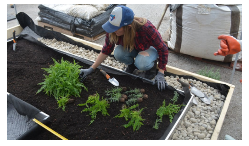
Green Roof Installation and Maintanence Professional (GRIMP) training in progress.

The following document summarizes green roofs and wall policies across Canada and the United States that encourage widespread adoption. The policies are separated into two categories mandatory requirements and incentive programs. There is also a section that lists other policies that promote green infrastructure for stormwater management. These case studies can be used in conjunction with Green Roofs for Healthy Cities' other resources to create well-developed and effective policy.