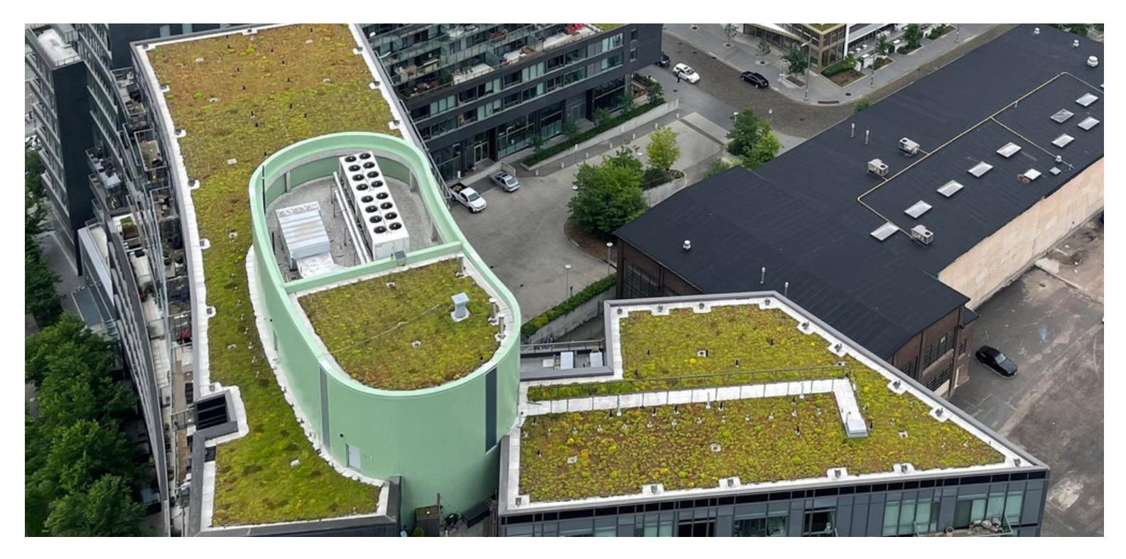
River City 3 Condominiums, Toronto.

Ultimately, success in increasing green roof policy and the widespread implementation of green roofs is a direct result of green roof champions in government and industry collaborating to promote and sponsor legislation. In partnership with third parties, such as Green Roofs for Healthy Cities, and passionate citizens advocating for change, green roofs will continue to be assertively advocated for and implemented as an essential and effective means to combat local and global environmental challenges.