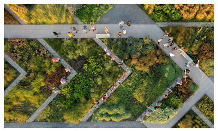
The Old Chicago Post Office in downtown Chicago

Green roofs are able to provide additional thermal insulation benefits for many roofs, thereby reducing energy consumption associated with space heating and cooling. Portland State University and Environment Canada established an <u>Energy Calculator</u> which provides base levels of energy savings in multiple climates across North America. Many of the energy savings benefits to buildings depend on their age, with older buildings often lacking sufficient insulation the benefits are greater.