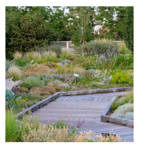
Mordecai Children's Garden green roof.

The period of innovation and testing of feasibility of green roofs is in the past. The systems are available, technical approaches are well defined, and the economic efficacy has been determined over an array of economic and bioclimatic geographies, from Alaska to southern Florida and all parts in-between. Public policy programs and awareness campaigns may be required to break through resistance to widespread implementation and facilitate the use of green roofs. In cities already with high rates of green roof installation, public policies have served to stimulate the green roof market by educating developers and community members as well as providing financial incentives and/or regulations.