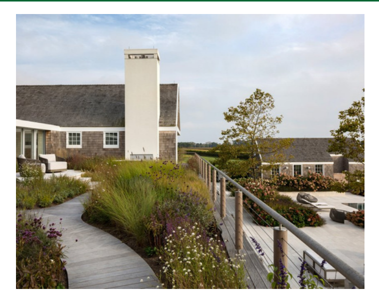
Award of Excellence winning Coastal Cottage, South Shore, Eastern Long Island.

Clearly defined requirements are readily achievable and can spur and expand the development of higher quality green roofs and lower costs as markets mature. This is especially true in stormwater management permitting where high-performance green roof systems can outshine lower performance green roof systems. This may require the testing of various systems and components, to ensure their performance meets code requirements. There are several ASTM testing protocols specific to green roof components that provide consistent, across-theboard results. See appendix A for all green roof standards.