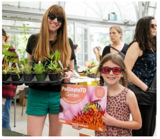
PollinateTO grant recipients, Toronto.

Incentives have played a big role over the last decade in many cities, particularly when the benefits of green roofs were unproven and/or unknown. Incentives make sense now, only if it is the only politically viable path.