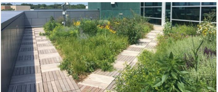
East Building Addition, Adlai E. Stevenson High School, Linconshire, IL.