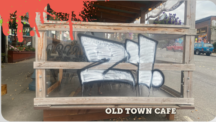
OLD TOWN CAFE