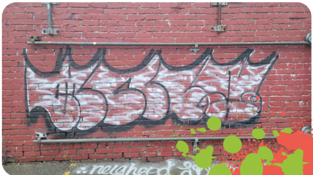
PUBLIC AND PRIVATE PROPERTY GRAFFITI REMOVED BY DBP