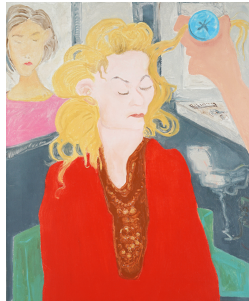
Jeff Bliumis Anonymous, 2017 Oil on linen 29 x 24 inches