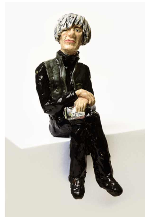
Dasha Bazanova Andy Warhol #5 , 2019 Glazed ceramic 8 x 3 x 4 inches