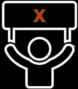
PHOTO PETITION AGAINST THE GONDOLA

We continue to advocate to maintain access to Wasatch climbing by engaging with public and private land managers. We also continue to hold the lease with The Church of Jesus Christ of Latter-day Saints for climbing access and stewardship to continue at the privately owned 140 acre Gate Butte parcel in Little Cottonwood Canyon.