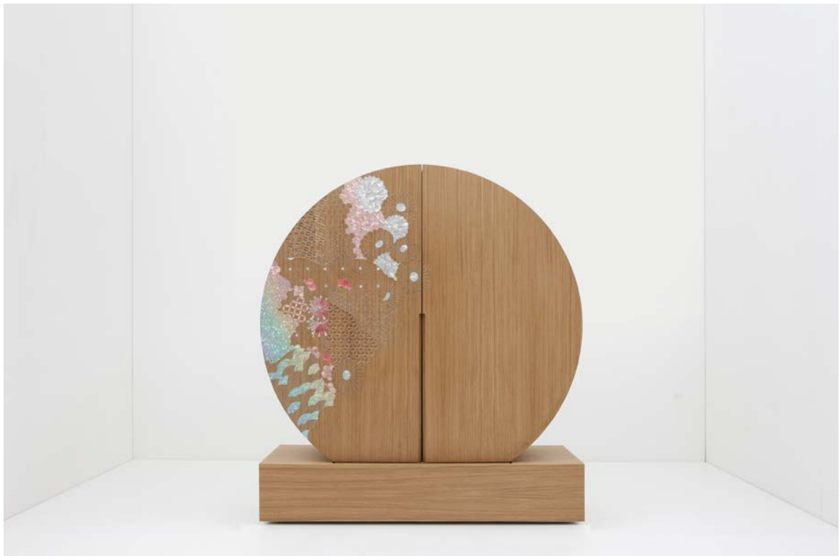
'Land of the Rising Sun', Studio Nada Debs