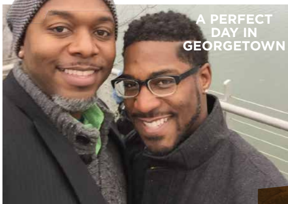
A PERFECT DAY IN GEORGETOWN