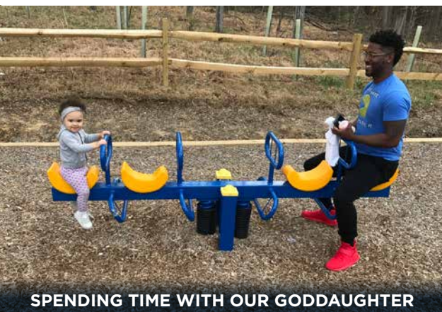
SPENDING TIME WITH OUR GODDAUGHTER