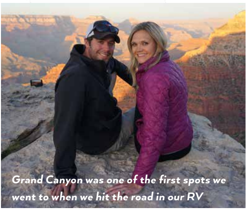
Grand Canyon was one of the first spots we went to when we hit the road in our RV