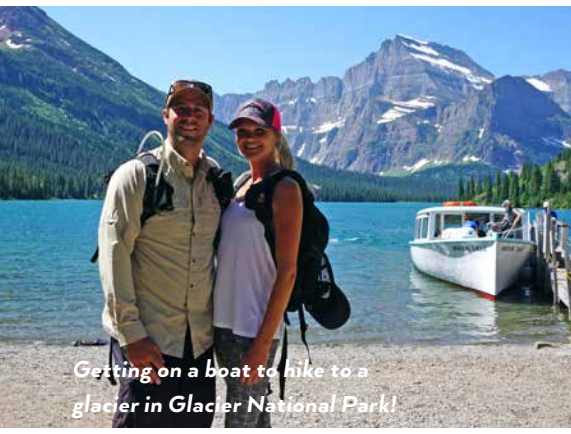
Getting on a boat to hike to a glacier in Glacier National Park!