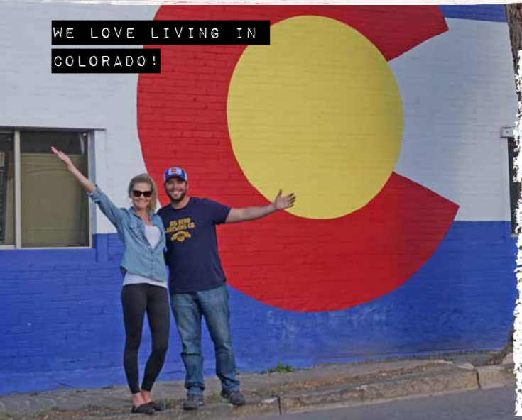
WE LOVE LIVING IN COLORADO!

Another reason we love Colorado is that it's centrally located and allows us to easily take road trips to other parts of the country! As strange as it sounds, we can feel at home anywhere with all the traveling we've done and the connections we've made to people and places all over the world.