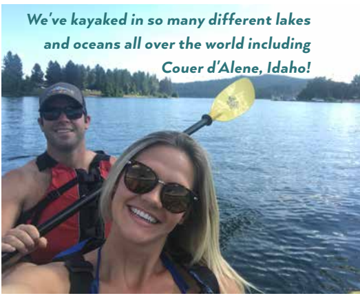
We've kayaked in so many different lakes and oceans all over the world including Couer d'Alene, Idaho!