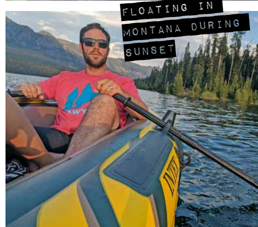
FLOATING IN MONTANA DURING SUNSET