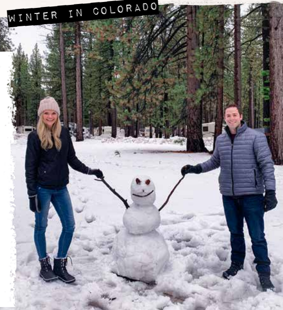
WINTER IN COLORADO

OUR IDEA OF HOME IS being together because no matter where we are, together we feel SAFE AND LOVED and that is what "home" is all about, in our opinion