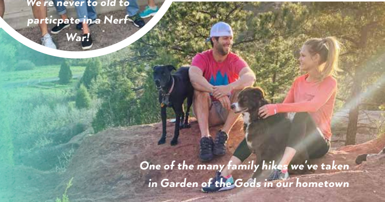
One of the many family hikes we've taken in Garden of the Gods in our hometown

We have two sweet dogs, Kyla and Pepper. Kyla is an 11-year-old Australian Shepherd who loves watching TV and stand up paddle boarding with Lindsay. Pepper is a snuggly 8-year-old Black Lab mix who can't get enough of playing fetch. They come along on all our adventures! If we can love dogs this much, we can't imagine the love we'll have for a child!