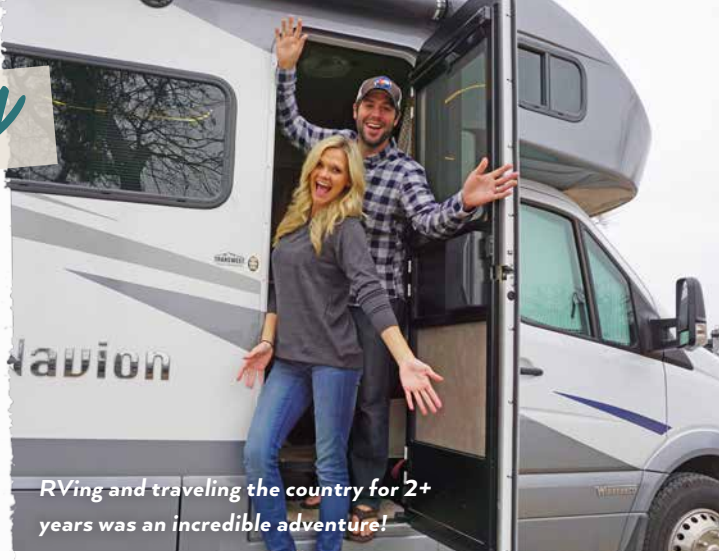
RVing and traveling the country for 2+ years was an incredible adventure!

We spent the past two years traveling the country full-time while living in an RV! We knew we'd love the adventures, but we didn't expect the growth that happened inside of us. Taking a big risk to hit the road changed us. It made us more passionate, intentional, and driven (no pun intended!) people. We accomplished some of our bucket list items and yet, it brought us back full circle to wanting to grow our family.