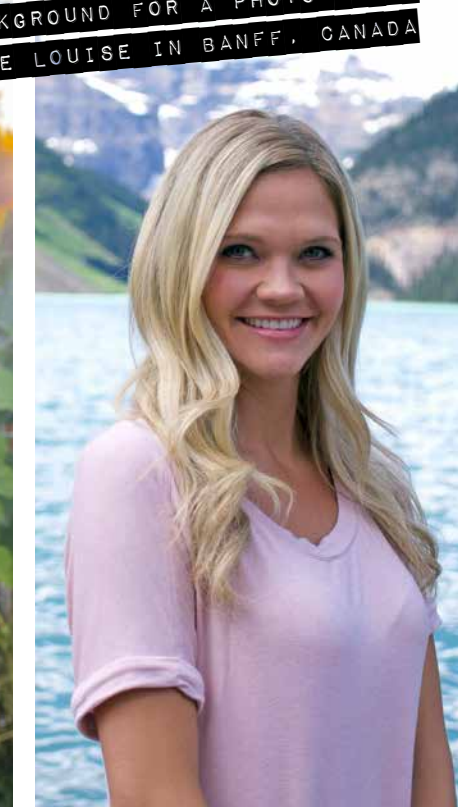
THERE IS NO GREATER BACKGROUND FOR A PHOTO THAN LAKE LOUISE IN BANFF, CANADA