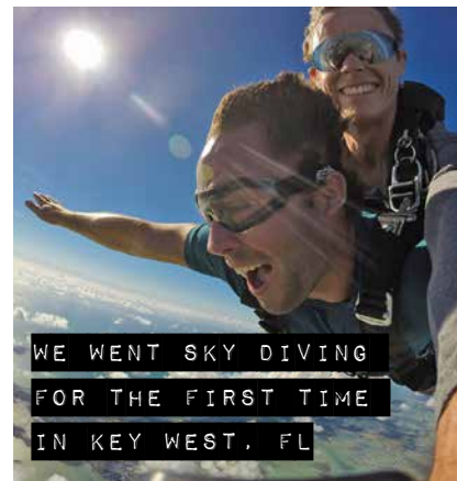
WE WENT SKY DIVING FOR THE FIRST TIME IN KEY WEST, FL

HE'S INSPIRED ME IN SO MANY WAYS AND I CAN'T WAIT TO SEE WHAT AN amazing role model he'll be to our future child.