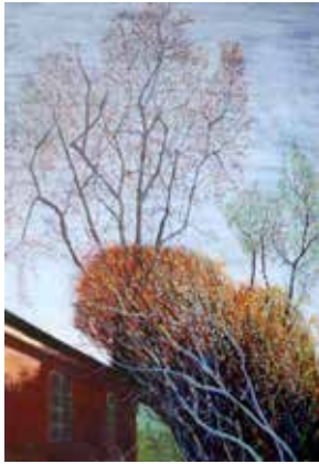
47 B Wilson Autumn Mixed 97.5 x 74 £30