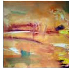
24 Madeline Francis Estuary Acrylic 22.5 x 22.5 £40