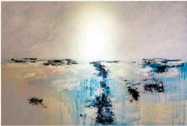
49 Julie Christine Gannon Fresh West Acrylic on panel 121.5 x 181 £750