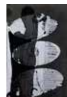
64 Cath Fairgrieve Ode to Modernity 1 Vitreous enamel on steel 32 x 27 £85