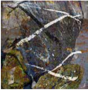
11 Steven Irwin Carrag II Photomontage 52 x 51.5 £100