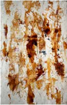
53 Arthur Thomas Dal Dy Dir 5 Plaster, shellac & ink 160 x 100 £150