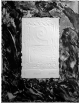
A Glenys Cour March Collage & etching 70 x 59 £220