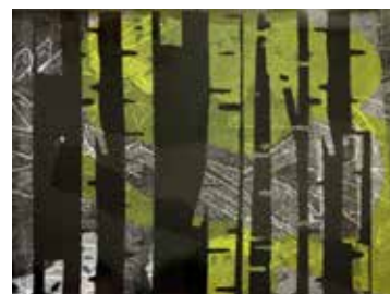
D Suzie Ross Black Hill Print 30.5 x 38 £50