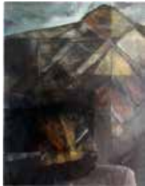
13 Graham Meredith Mythical Landscape Mixed 32 x 27 £50