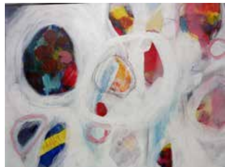
34 Rosemary Graham Peeking 1 Mixed 48.5 x 58.5 £200