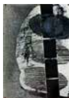
63 Cath Fairgrieve Ode to Modernity 2 Vitreous enamel on steel 32 x 27 £85