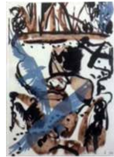
H Sarah Poland Raven Fingers Pointing Call All Lithograph 52 x 43 £180