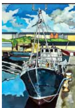
65 David Phillip Street Lady Kate Acrylic on panel 50 x 38.5 £100