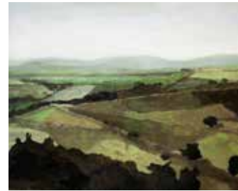
56 Robert Lawton Landscape Oil 40.5 x 51 £80