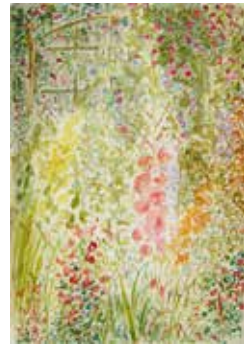
22 Phil Alder Gladioli Watercolour 43.5 x 33 £75