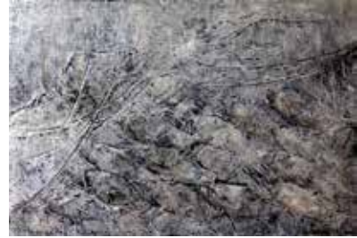
48 William Gannon Plenty More Fish 5/9 Recycled paper 48.5 x 66.5 £130