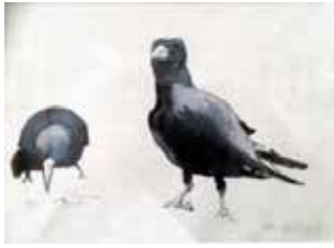
5 Peter Rossiter Two Crows Watercolour 38 x 43 £30