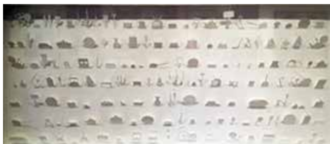
61 Rachel Vater All the Things I Don't Own Paper 36 x 86 £100