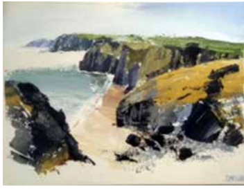
29 Sian McGill Lydstep Acrylic 44 x 54 £375