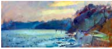
41 Jon Houser The Coast at Amroth, Evening Haze Oil on panel 29 x 49.5 £170