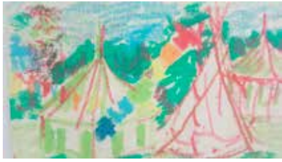
23 Madeline Francis Festival Acrylic 20 x 25 £40