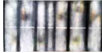
6 Peter Rossiter Vanishing Mixed 30.5 x 63 £30