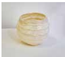
O Vivienne Albiston Seed Pod Porcelain £40