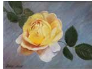
20 Roger Wyngrave Only a Rose Oil on panel 19.5 x 24.5 £30