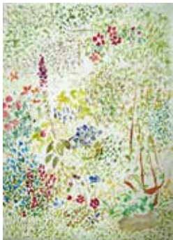
27 Phil Alder Summer Garden 2 Watercolour 33.5 x 28.5 £50