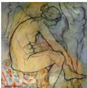
39 Susan Sands Quiet Time Mixed 40 x 40 £300