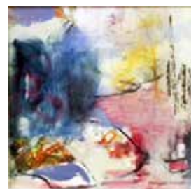
46 Philippa Sibert Gentle Morning Mixed 33 x 33 £100