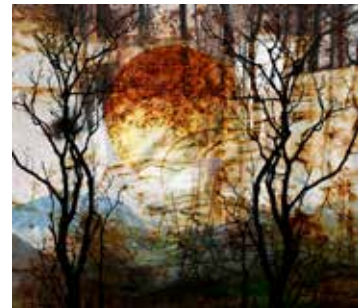
8 Steven Irwin Winter Sunrise Photomontage 52 x 51.5 £100