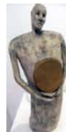
P Clare Ferguson-Walker Caught the Sun Ceramic £240