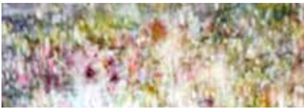
21 Madeline Francis Summer Garden (detail) Acrylic 39.5 x 120 £150