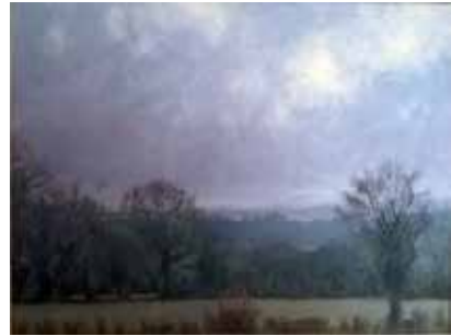
36 Roger Wyngrave Bird Drizzle Over the Preselis Oil on canvas 49 x 60.5 £110