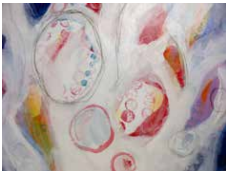
33 Rosemary Graham Pulstar 2 Mixed 48.5 x 59 £200