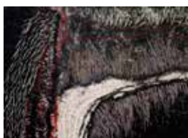
59 Indre Dunn Reminiscence at Dusk Hand embroidery 32.5 x 40 £260