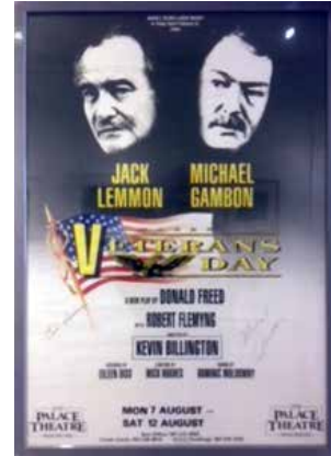
N Signed Theatre Poster 80 x 55 £80