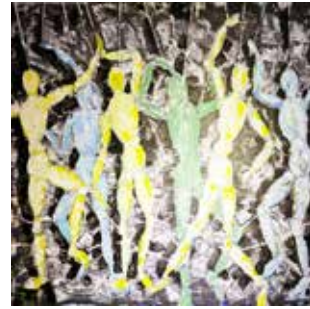
68 Paul Thomas Shakers and Movers Acrylic 86.5 x 100 £60