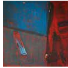
F Geoff Yeomans Untitled Monoprint 46.5 x 44 £90