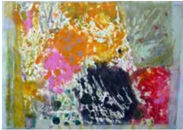
25 Diana Heeks Garden Oil on paper 54.5 x 72 £175