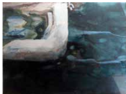
40 Roy Ayres Porthclais IV Watercolour/gouache 42 x 48 £90