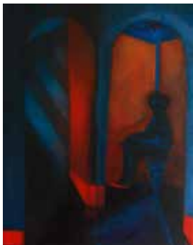
57 Christine Kinsey Yr Ymweled / The Visit Oil on canvas 53 x 42.5 £450