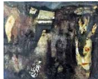
58 Jessica Woodrow We Will Live in the Mountains Watercolour on paper 38.5 x 43 £200