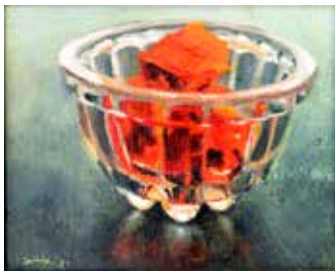
9 Dai Kayll Jelly and Mould Oil on board 22.5 x 26 £140