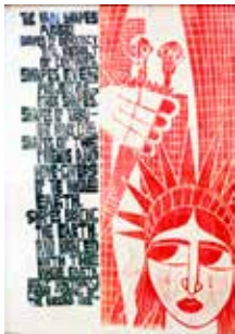
I Paul Peter Piech Song of the Broad Axe Print 64 x 52.5 £120