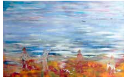
70 Paul Thomas Early Start Acrylic 70.5 x 100.5 £60