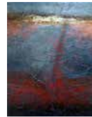
50 Patricia McParlin Tonight I Mixed 35.5 x 28 £250