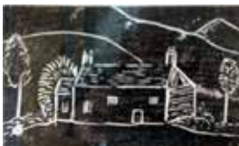
3 Anthony Eynon Snowdonia Linoprint 24 x 32.5 £25