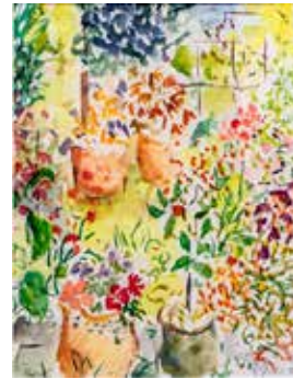
26 Phil Alder Summer Garden 1 Watercolour 33 x 28 £50