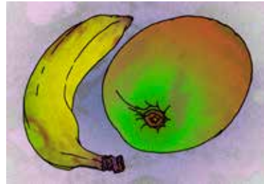
L Martin White Banana Mango Line drawing/digital print 29.5 x 42 £100