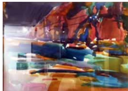
28 Keith Williams Pendine: Rain Arriving, Now Arrived, Dolman Point Watercolour 30.5 x 63 £150