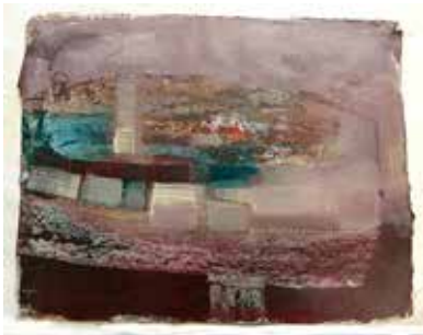
37 Elizabeth Haines Talmynydd Landscape Mixed 55.5 x 65 £350