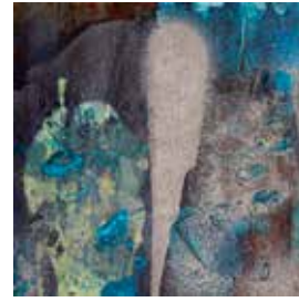
74 Lee Williams Untitled Mixed 35 x 35 £60