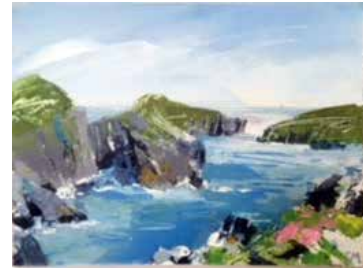
30 Sian McGill Around from Caerfai Acrylic 38 x 43 £275