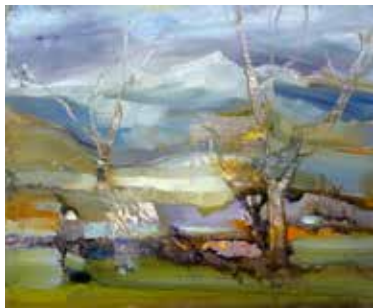
43 Elizabeth Haines Snowdon Acrylic 42.5 x 46.5 £250