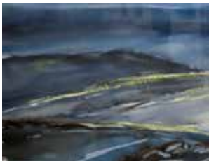
71 H Gravell Preseli 2 Watercolour 42 x 52.5 £80