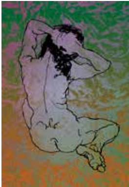
K Martin White Sarah T 19 Line drawing/digital print 42 x 29.5 £100