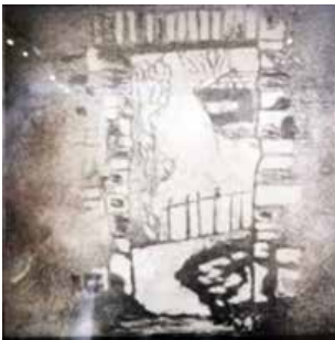
7 Katy Hocking Oven Door Pencil 25 x 25 £50