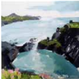
31 Sian McGill Blue Lagoon Acrylic 44 x 44.5 £295