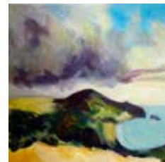
72 Paul Hallam Abermawr Acrylic on canvas 50 x 65 £100