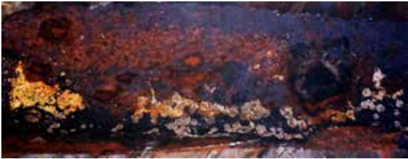
G Geoff Yeomans Limpet 1/25 Giclée print 60 x 115 £120