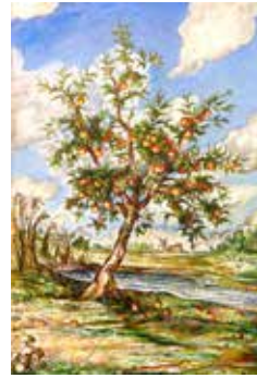
18 Austen Pinkerton Apple Tree by Stream Crayon & ink 41.5 x 31.5 £300