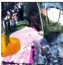
45 Philippa Sibert Woodland Clearing Mixed 33 x 33 £100