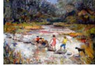
54 Susan Sands Stepping Stone, Cresswell Quay Acrylic 45.5 x 61 £50