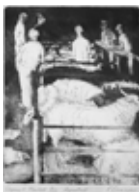
C Peter Blicow Crymych Market Etching 37.5 x 29.5 £75