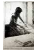
B Peter Blicow Woman Ironing Etching 38 x 27.5 £75