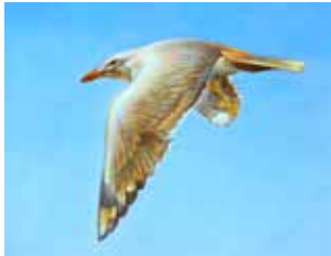
19 Austen Pinkerton Seagull Acrylic on card 32.5 x 37 £300