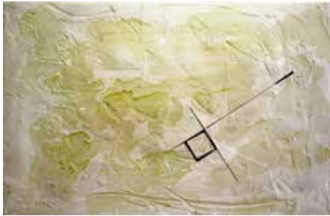
69 Arthur Thomas Dal Dy Dir 4 Plaster, iron nails, ink & shellac 59 x 90.5 £120