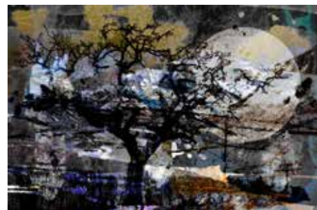
4 Steven Irwin Coeden Photomontage 52 x 77 £200