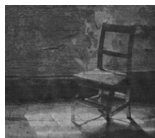
62 Ainsley Hillard Study in Sunlight - Small Chair Jacquard weaving 41 x 40 £300