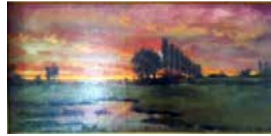
12 Dai Kayll Poplars Cottage Oil on board 31 x 51.5 £200