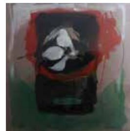
16 Andrea Kelland Green Fuse Gouache 25.5 x 25.5 £60