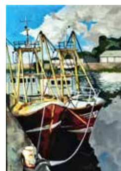
66 David Phillip Street Two Trawlers Acrylic on panel 52.5 x 40 £100