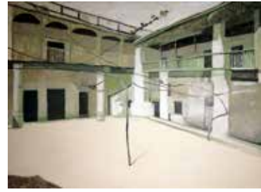
42 Robert Lawton Nun's Breath Oil 41 x 51 £100