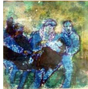
14 Osi Rhys Osmond Piorseddiad Mixed 35 x 35 £100