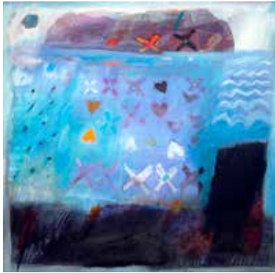
35 Diana Heeks Ynys 1 Mixed 94.5 x 94.5 £600