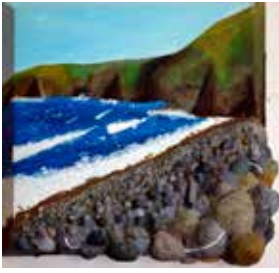
73 Jo Prout Linti Hed Mixed 32 x 31 £50