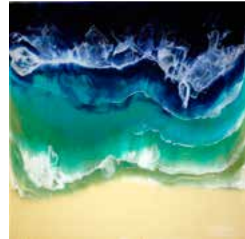
44 Stephen Rew Aerial Seascape Resin 65.5 x 65.5 £850