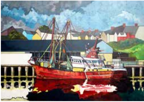
67 David Phillip Street The 576 Acrylic on panel 68 x 92 £200