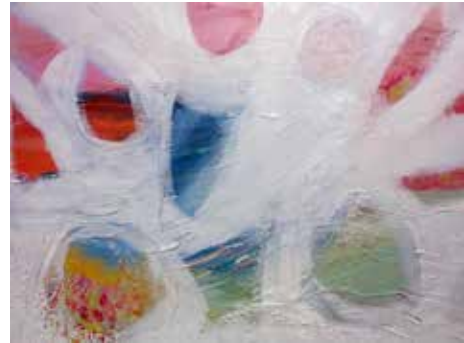
32 Rosemary Graham Flow By Mixed 49 x 58.5 £200