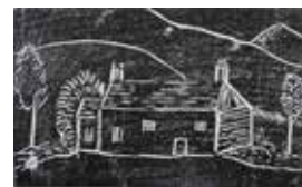
2 Anthony Eynon Anthony Cox Cottage Linoprint 23.5 x 32.5 £25