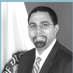
JOHN B. KING, JR. CEO, The Education Trust Former U.S. Secretary of Education