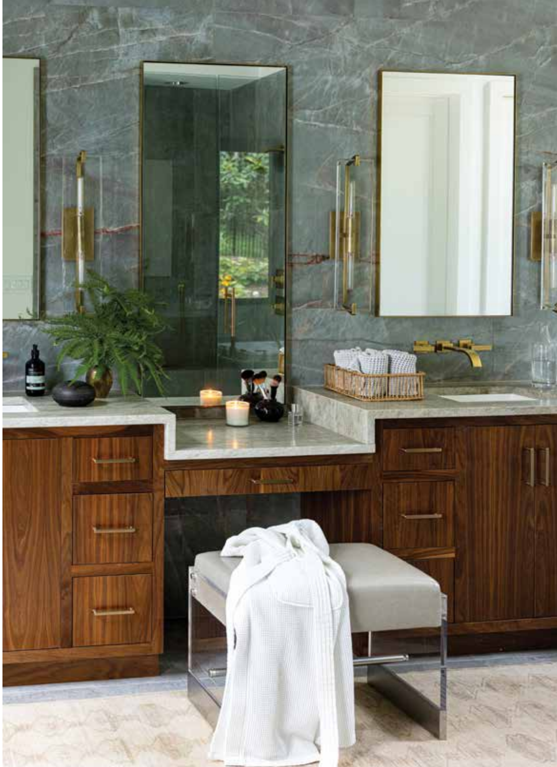
Green marble tile with glints of satin brass plumbing work hand in hand with rich wood cabinetry to create a quiet serenity in the owner's bath. Sophisticated linear glass sconces warm the space while mirrors reflect natural light throughout.

luxurious sitting room offers solitude with a resort-like poolside ambiance, and the private patio off the family's den is the perfect place to enjoy a cup of tea while soaking in nature. Larger crowds can gather around the outdoor fireplace, take a dip in the pool, or spend hours talking at the dining room table after a great meal. There's even a fun bunkroom where the grandkids can