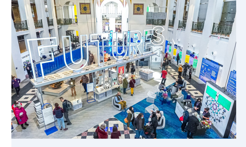
Fig. 2. The Rockwell Group design combines surreal pastel colors and unvarnished elements such as exposed wood and bolts referencing the building's industrial, unfinished interior.