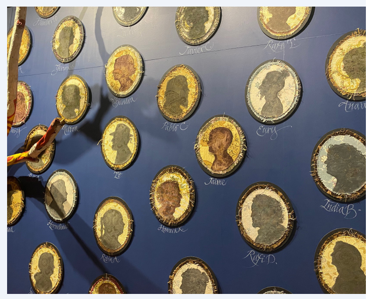
Fig. 3. El árbol geneológico/Camafeos (Family Tree/Cameos), 2017–21. In the last gallery, painted tree branches collected in the aftermath of Hurricane Maria frame a wall of cameo portraits. These black silhouettes on wooden disks refer to family – personal, chosen, and global – who are struggling through so many adversities.