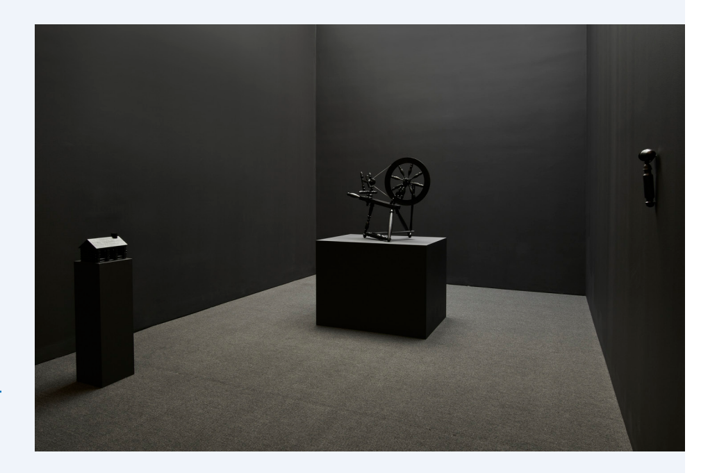
Fig. \ {\rm 3.}\ The dim light and the dark gallery encourage visitors to examine these dark ebony wood sculptures closely.