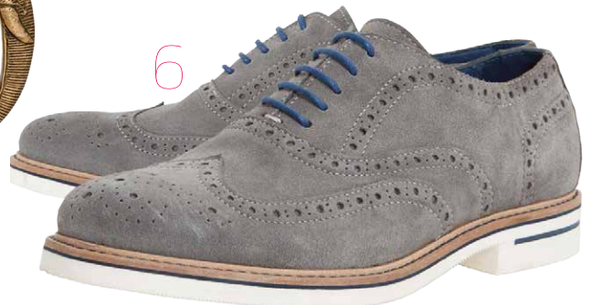
1 Black Sands beach umbrella, $320. thefoxesden.co.nz 2 Silver Lining Cloud necklace in sterling silver, $123. audreylovesruby.com 3 Freshbrush subscription, $32 per year. freshbrush.co.nz 4 Yu Mei three-quarter Braidy bag in buttermilk deer nappa, $399. yumeibrand.com 5 "Dinner Time" art print, from $25. glennjonesart.com 6 Brooklyn suede brogue, $230. 3wisemen.co.nz 7 Maharaja wine cooler in vintage brass, $449. trenzseater.com