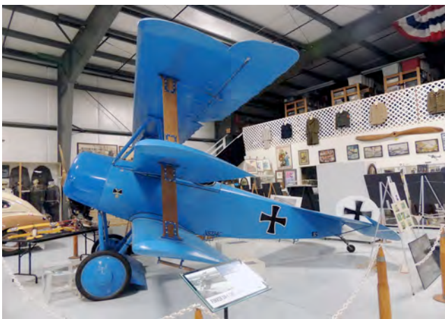
Left: Warhawk Museum in Nampa, ID

After lunch, we walked four minutes north on Municipal Way to the Warhawk Air Museum. This museum is housed in several large hangars and has an incredible collection of airplanes and wartime memorabilia. We saw everything from a fully restored Fokker DR-1 tri-plane to the "Programme for the Victory Opening" of the British Parliament in August 1945 to children's wartime toys. We would like to have stayed longer, but we wanted to arrive back in Reno before dark.