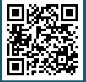
National Human Trafficking Hotline

24/7 NATIONAL HUMAN TRAFFICKING HOTLINE CALL 1-888-373-7888 | TTY 711 | TEXT 233733