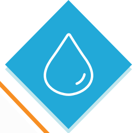
PiMag MicroJet Shower System