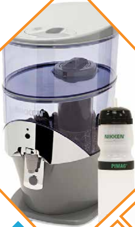
PiMag Water Set