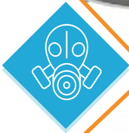
Kenzen Vital Balance