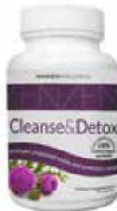
Cleanse & Detox