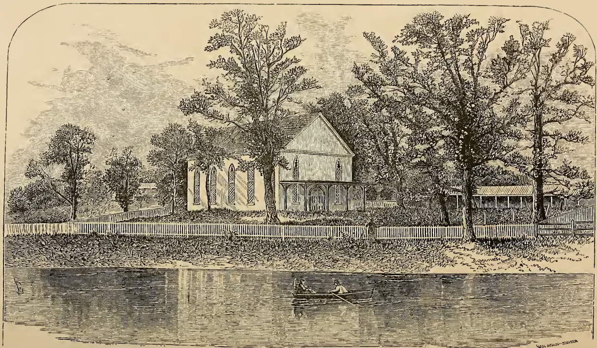
NESHAMINY CHURCH AND CREEK.