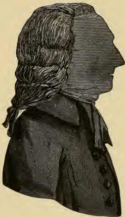
REV. WILLIAM TENNENT, SR.