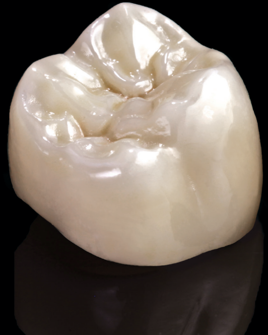
ZEUS ZIRCONIA CROWN

"ZEUS is a fantastic alternative to PFM! Not only have we eliminated the ceramometal interface—which was easily fractured—but it is all ceramic, milled to perfection, rarely requires adjustment at placement... making my job easier and the patient's experience better! A win-win for everyone!"