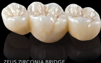
ZEUS ZIRCONIA BRIDGE